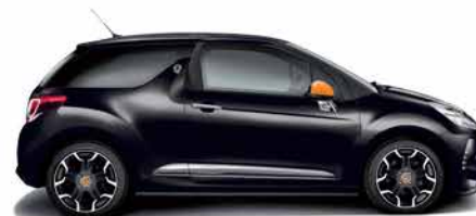
CITROËN DS3 DSIGN NOIRE by BENEFIT