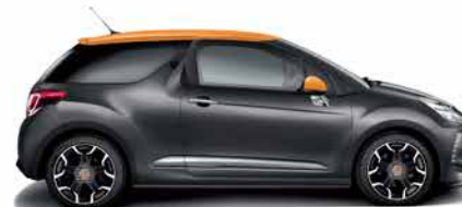
CITROËN DS3 DSTYLE by BENEFIT