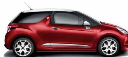
CITROËN DS3 DSIGN by BENEFIT