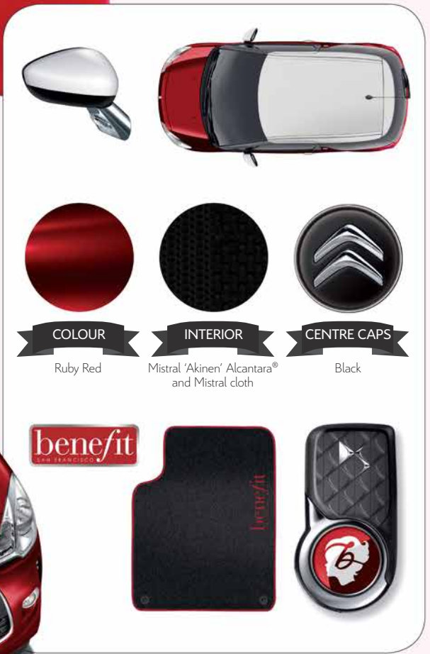
COLOUR Ruby Red