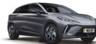
CAMDEN GREY METALLIC*