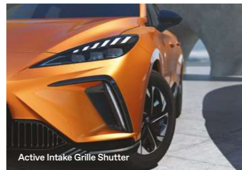
Active Intake Grille Shutter