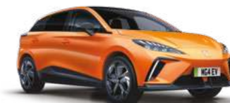
VOLCANO ORANGE PREMIUM**