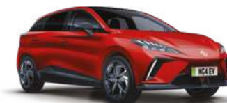
DYNAMIC RED TRI-COAT*

*Metallic, tri-coat and premium paint optional at extra cost. **Trophy Long Range only.