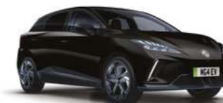
BLACK PEARL METALLIC*