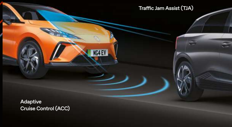
Traffic Jam Assist (TJA)

The MG Pilot suite of high-tech driver assistance technology gives you added confidence on the road. A selection of warning and alert features assists the driver, maintaining safety and simplifying everyday driving.