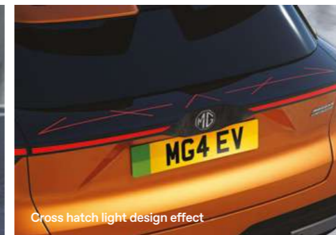
Cross hatch light design effect