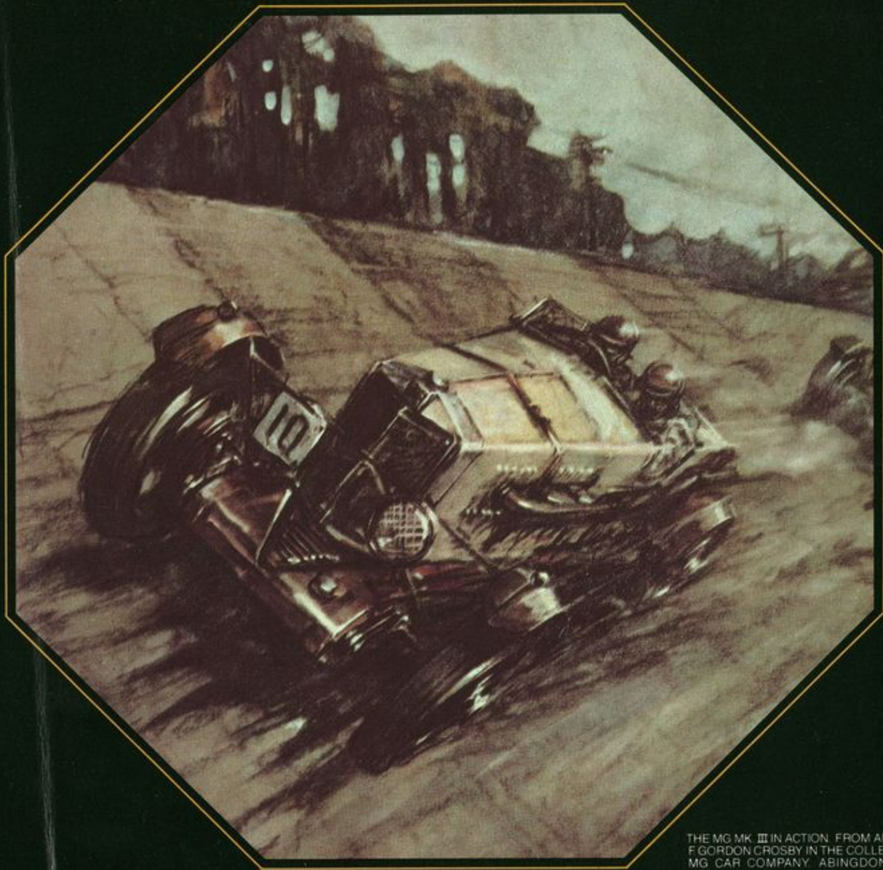
THE MG MK. III IN ACTION. FROM AN ORIGINAL BY F. GORDON CROSBY IN THE COLLECTION OF THE MG CAR COMPANY, ABINGDON-ON-THAMES.