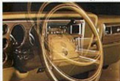
Tilt Steering Column.

Pictured here are just a few of the many options available at extra cost on the 1982 Gran Fury. One or more of them can only add to your driving pleasure and could mean extra value for you at resale time.