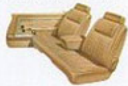
Optional all-vinyl bench seat with folding center armrest. Offered in Cashmere.

About this catalog. We have tried to make this catalog as complete as possible. And we hope you find it useful. However, since the time of printing, some of the information you'll find here may have been updated. Your dealer has details, and you should ask him for current information before ordering.