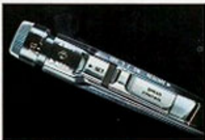
Automatic Speed Control/ Intermittent Wipers.