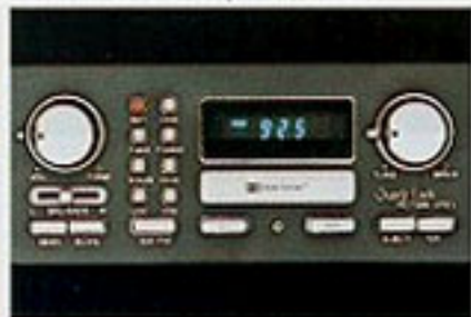
AM/FM Stereo Radio with Cassette Player.