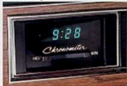
Electronic Digital Clock.