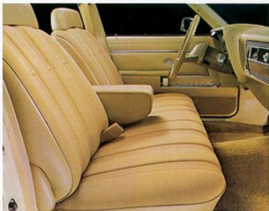
This cloth-and-vinyl bench seat with folding center armrest is standard on Gran Fury for '82. Shown here in Cashmere. Also available in Dark Blue, Silver, Red.