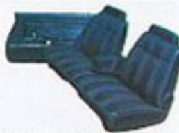
Standard cloth-and-vinyl bench seat with folding center armrest. Offered in Dark Blue, Silver, Red, Cashmere.