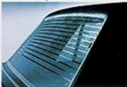
Rear Window Defroster.