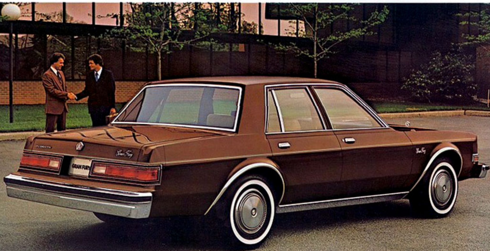
Gran Fury in Spice Tan Metallic.

Looking for traditional big car room, ride and comfort in a truly affordable package? Then consider our Plymouth Gran Fury for '82. You get all three of the above and then some because this year Gran Fury is not only priced to fit most budgets, it's trimmer and lighter, too, than last year's model.