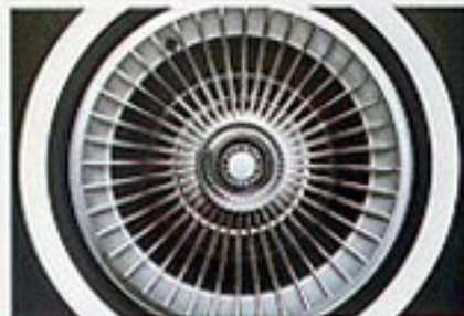
Premium Turbine Wheel Covers.