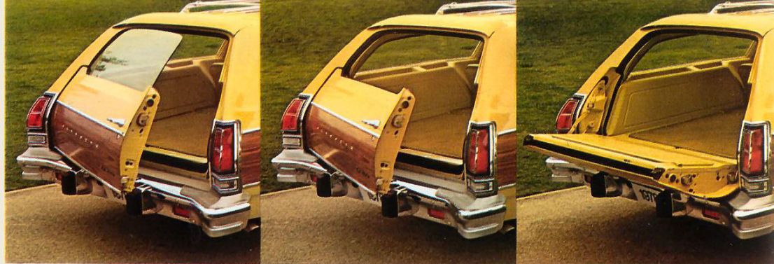
The convenience of a three-way doorgate is standard with the Suburbans. When lowered, doorgate permits easy access for loading. Easy going for you!