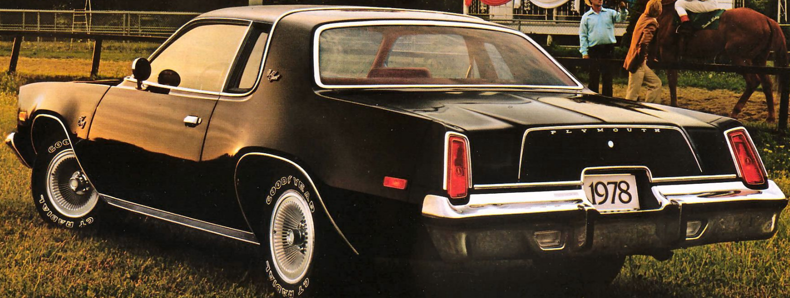
1978 Plymouth Fury Sport with optional canopy roof and optional aluminum Fascia road wheels.

Some items pictured on vehicles in this catalog are extra cost options. See chart on page 11 for engine and Lean Burn System availability restrictions in California and high altitudes.