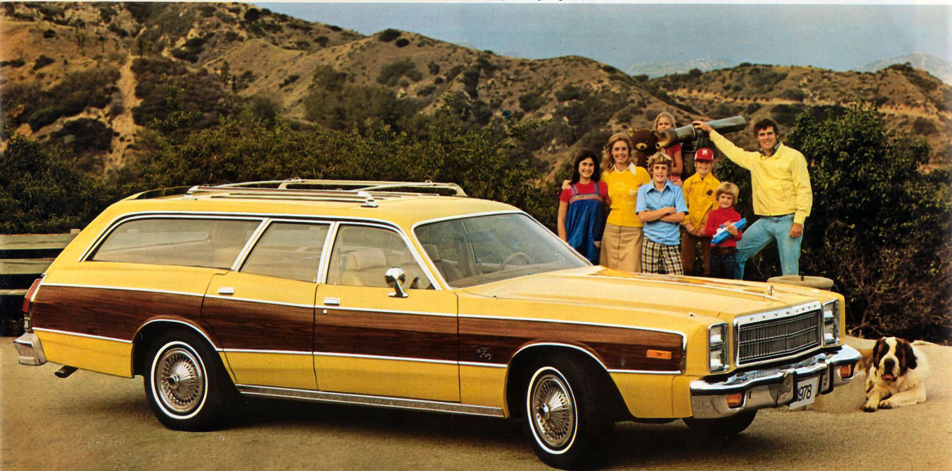
1978 Plymouth Fury Sport Suburban, with handsome simulated woodgrain exterior accents and optional roof luggage rack and air deflector.