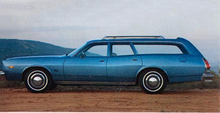
Fury Suburban with optional roof luggage rack, air deflector and deluxe wheel covers.