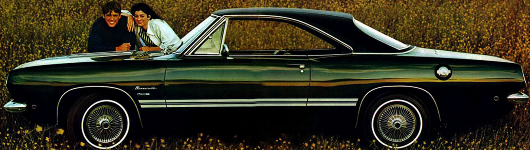
Barracuda Hardtop Coupe