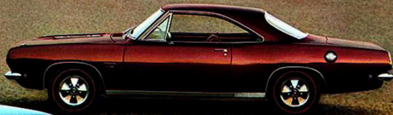
Barracuda Hardtop Coupe