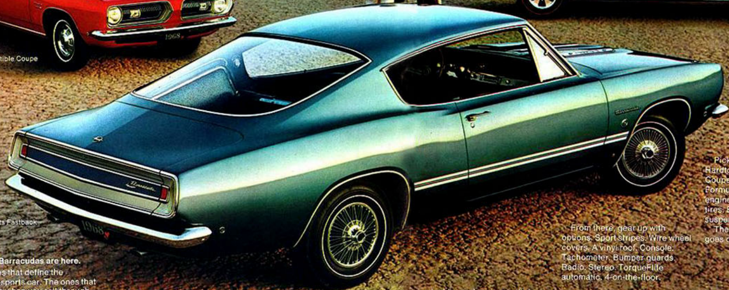
Barracuda Sports Fastback