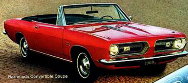
Barracuda Convertible Coupe