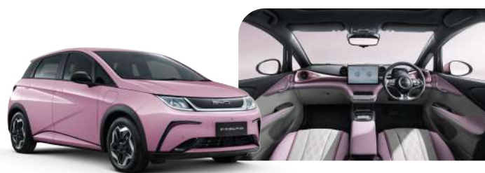
Exterior: Coral Pink Interior: Pink + Grey