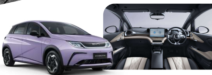
Exterior: Maldivo Purple Interior: Brown + Black