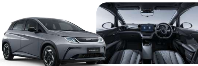
Exterior: Urban Grey Interior: Grey + Black