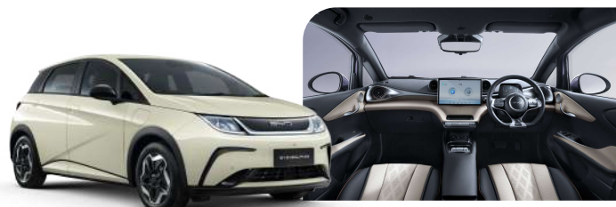
Exterior: Sand White Interior: Brown + Black