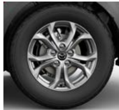
16" Alloy wheels (Silver)