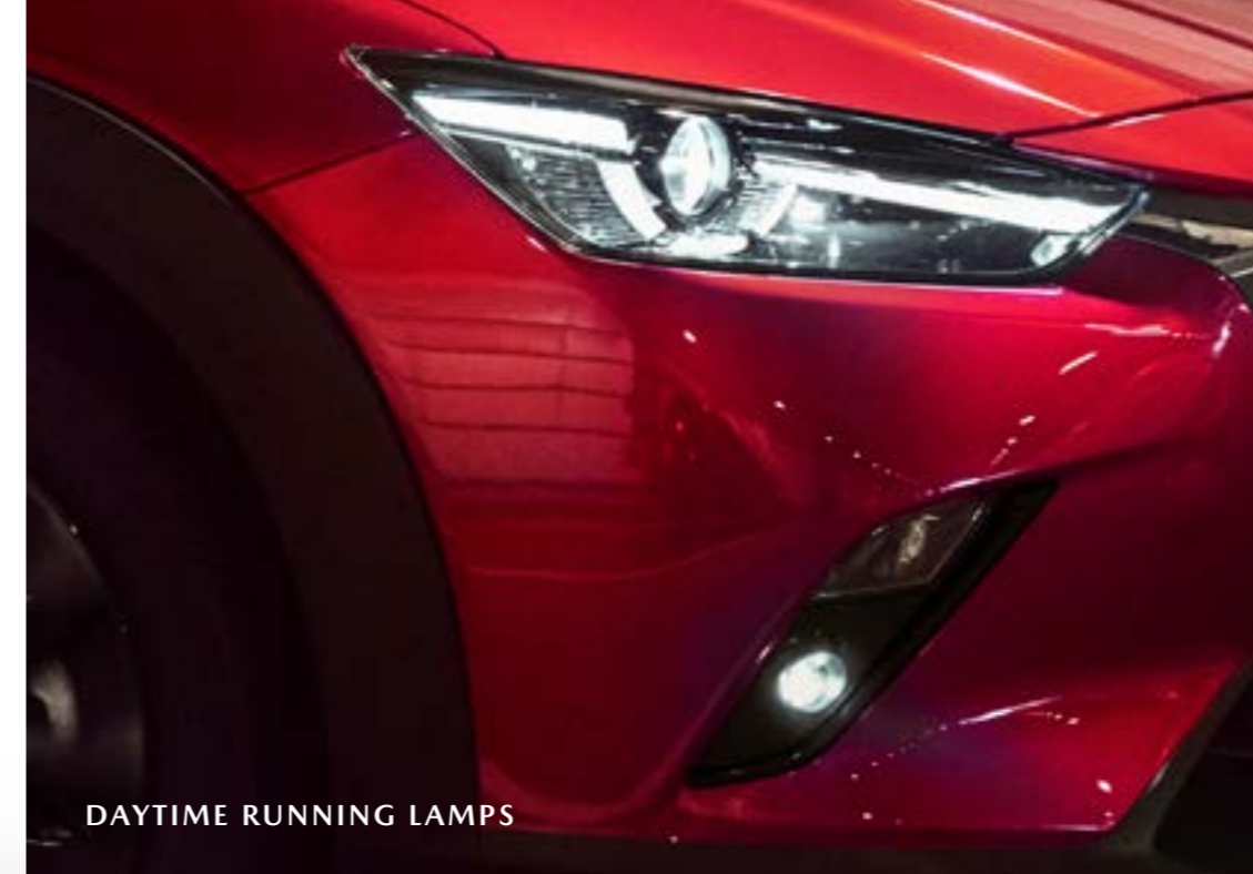
DAYTIME RUNNING LAMPS