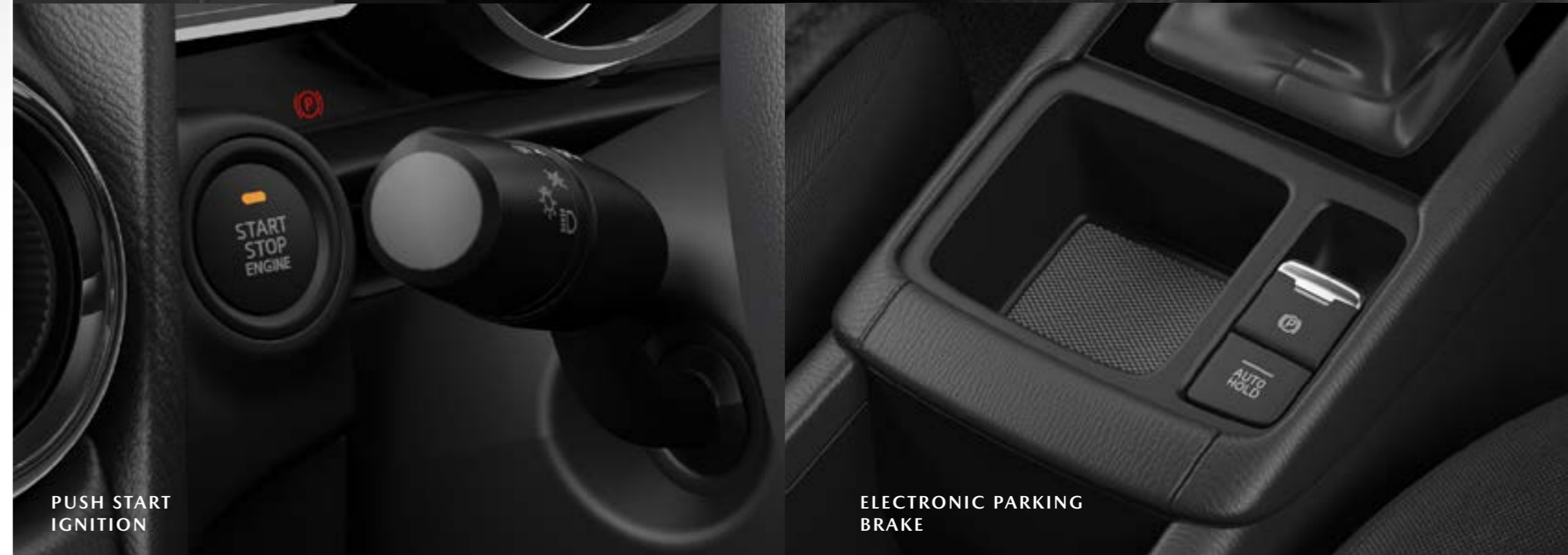
PUSH START IGNITION