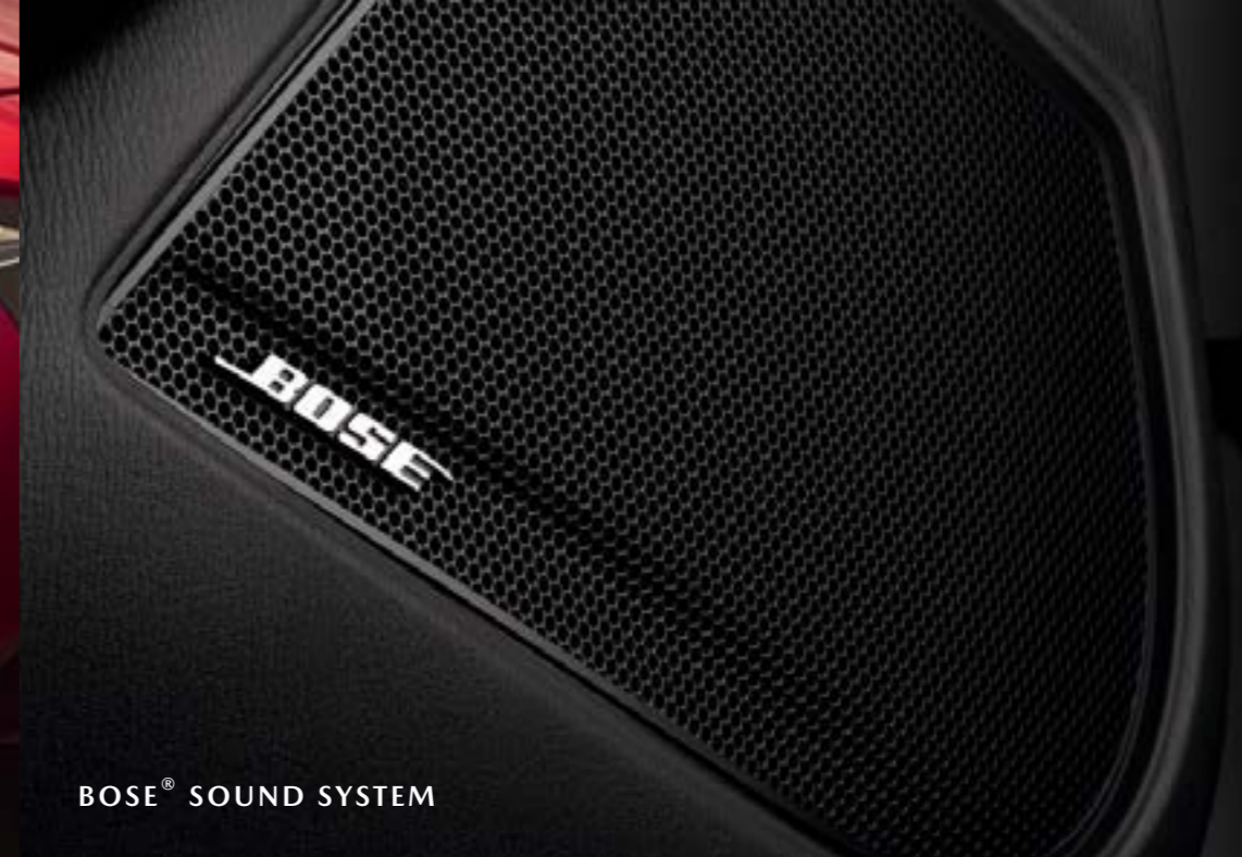
BOSE® SOUND SYSTEM