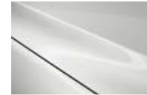
SNOWFLAKE WHITE PEARL