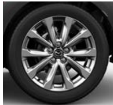
18" Alloy wheels (Bright)