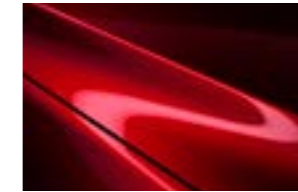
SOUL RED CRYSTAL