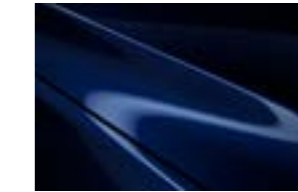
DEEP CRYSTAL BLUE