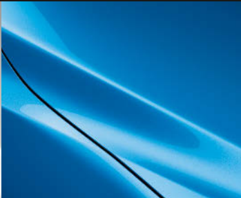
DYNAMIC BLUE MICA*