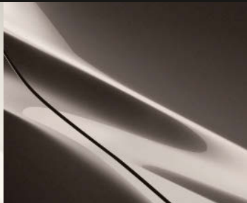
TITANIUM FLASH MICA*