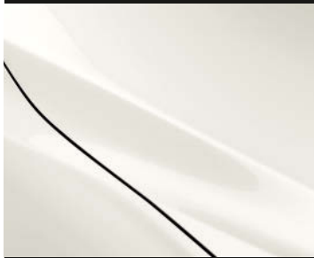
ARCTIC WHITE SOLID