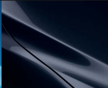
DEEP CRYSTAL BLUE MICA*