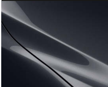
METEOR GREY MICA*