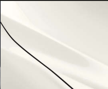
CRYSTAL WHITE PEARLESCENT*