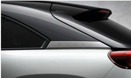
CERAMIC METALLIC PAINT WITH BRILLIANT BLACK ROOF AND GREY METALLIC UPPER SIDE PANELS