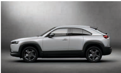
CERAMIC METALLIC PAINT

All-new Mazda MX-30 fuel economy and CO 2 . Mpg (l/100km): N/A. CO 2 emissions: 0g/km. Electric range up to 124 miles (WLTP). Range data given is preliminary and has been determined according to WLTP test procedure methodology. The preliminary values may differ from final type approval data. Everyday use may differ and is dependent on various factors. In particular: driving style, route characteristics, exterior temperature, heating/air-conditioning and battery condition.