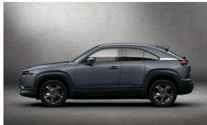
POLYMETAL GREY METALLIC PAINT