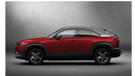
SOUL RED CRYSTAL METALLIC PAINT WITH BRILLIANT BLACK ROOF AND GREY METALLIC UPPER SIDE PANELS