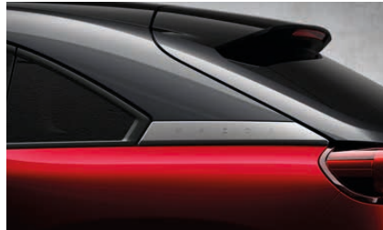
SOUL RED CRYSTAL METALLIC PAINT WITH BRILLIANT BLACK ROOF AND GREY METALLIC UPPER SIDE PANELS