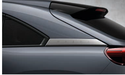
POLYMETAL GREY METALLIC PAINT