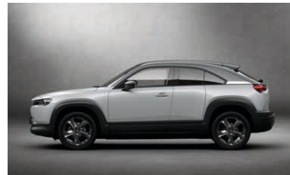
CERAMIC METALLIC PAINT WITH BRILLIANT BLACK ROOF AND GREY METALLIC UPPER SIDE PANELS