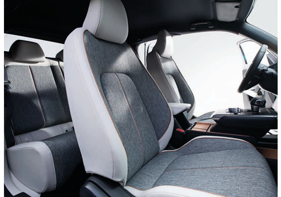
LIGHT GREY CLOTH WITH STONE LEATHERETTE