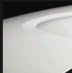
Crystal White Pearlescent