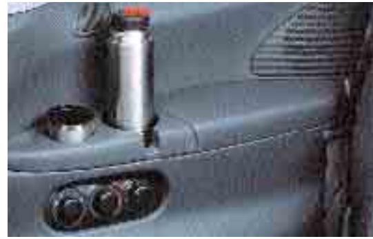
Independent controls for rear seat passengers