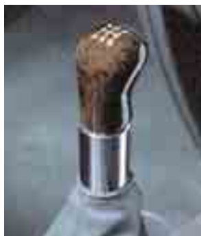
Wood-effect gear knob