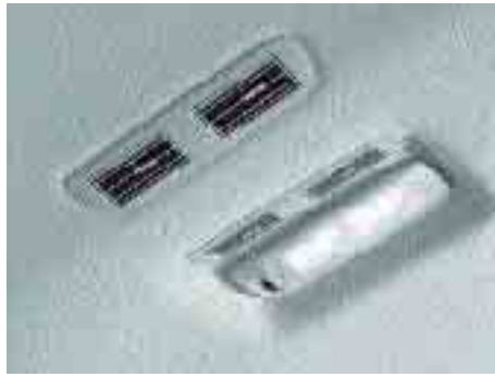
Ventilation for rear seat passengers