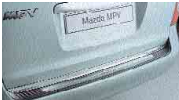
Chrome tailgate garnish and stainless steel rear bumper protector