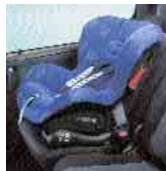
ISOFIX child seat