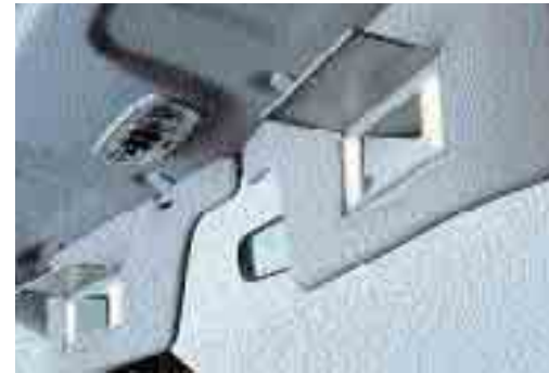
Illuminated vanity mirrors

For those who enjoy quality and style, the Mazda MPV is the choice of the connoisseur. And with its sporty carbon-effect instrument panel and suede-type black seat upholstery, the Mazda MPV cannot fail to attract attention. The two-tone environment colour lends a further sporty touch to an already sporty Mazda MPV. Your ears will be equally impressed, thanks to the Mazda modular audio system with CD player, 8 speakers and steering wheel mounted controls.