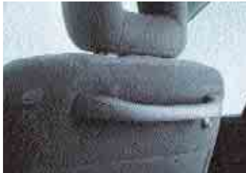
Seatback assist handles aid access for rear seat passengers