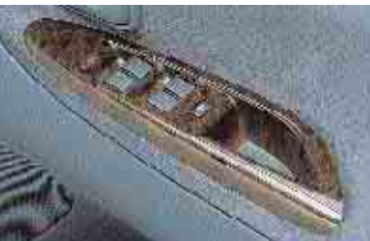
Wood-effect door panel inserts