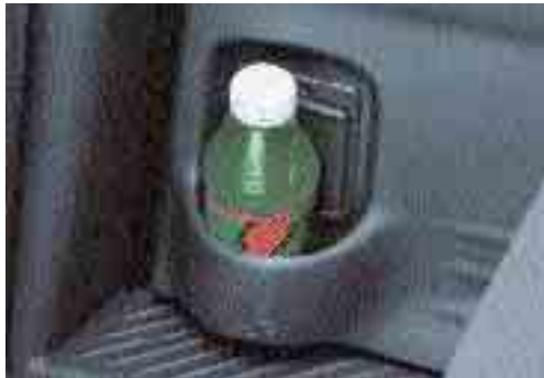
Numerous bottle holders are located around the interior