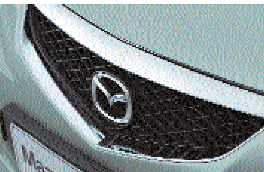
Chrome front grille garnish