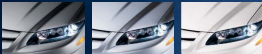
TITANIUM GRAY METALLIC