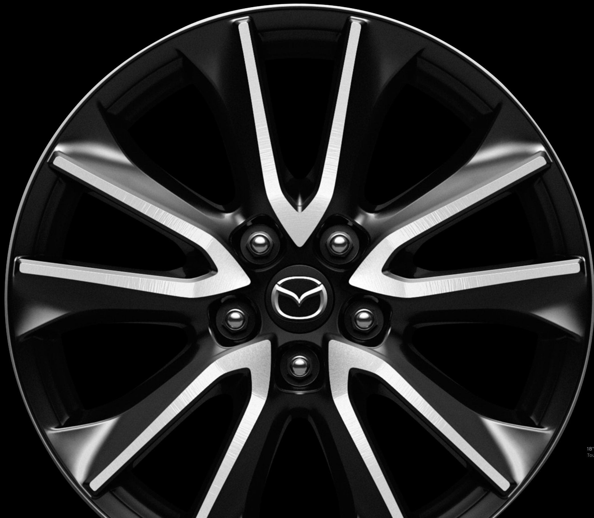
18" Alloy Touring and Grand Touring