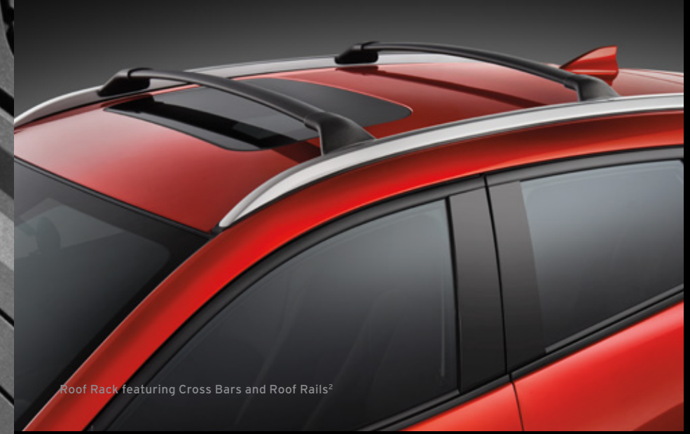
Roof Rack featuring Cross Bars and Roof Rails 2