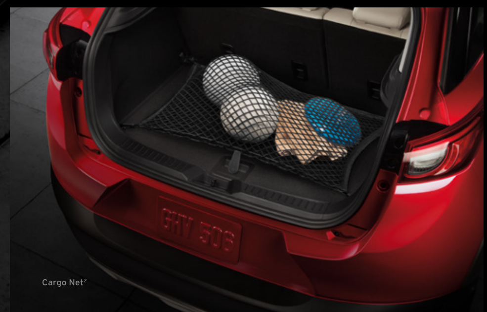
Cargo Net 2