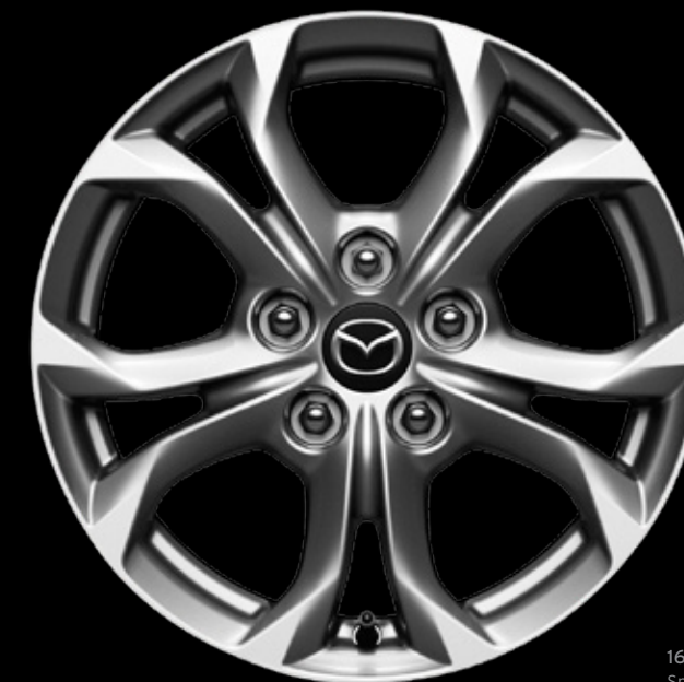
16" Alloy Sport

EVEN THE WHEELS TELL OUR STORY | Power. Balance. Beauty.