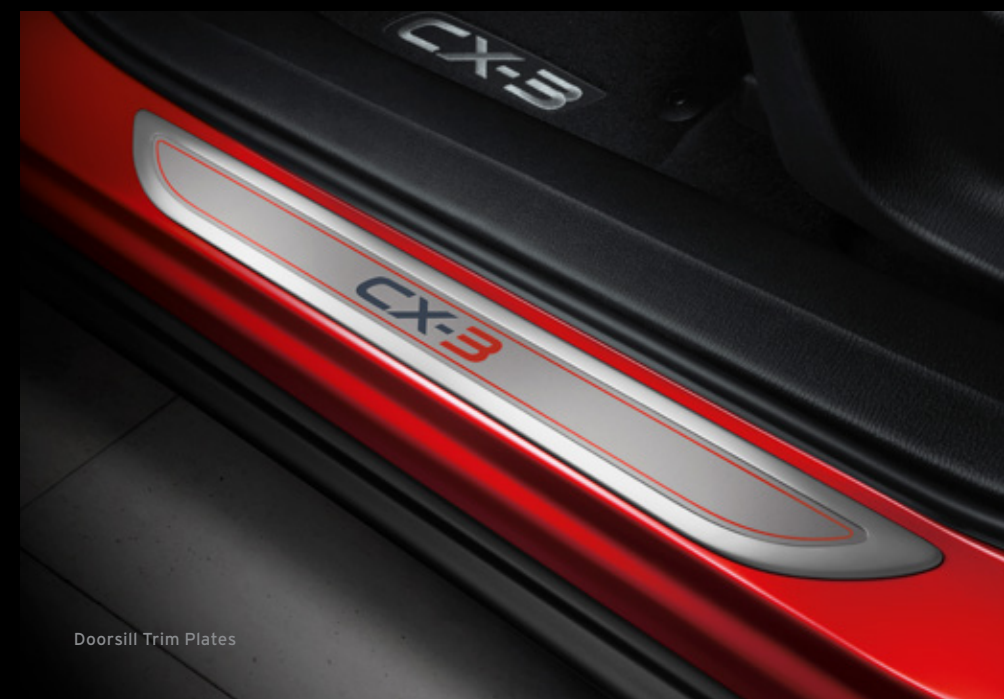
Doorsill Trim Plates