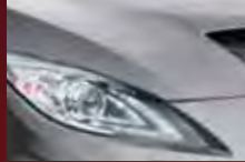
Liquid Silver Metallic