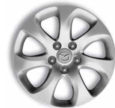
16" Steel Wheel Cover