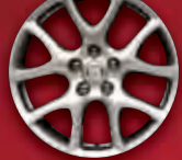
18" alloy wheel

MAZDASPEED Tech Package: Bose 265-watt Centerpoint 10-speaker Surround Sound System with in-dash 6-disc CD/MP3 changer; full-color Multi Informatoin Display (MID) with compact navigation system; SIRIUS Satellite Radio® with 6-month subscription; Mazda Advanced Keyless Entry & Push Button Start System; Bi-Xenon High-Intensity-Discharge (HID) auto-leveling headlights; Adaptive Front-lighting System (AFS); Automatic on/off headlights; LED clear-lens taillights; rain-sensing front windshield wipers; perimeter alarm system.