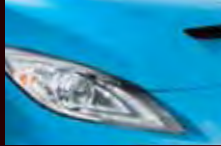
Celestial Blue Mica