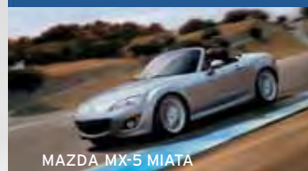
MAZDA MX-5 MIATA