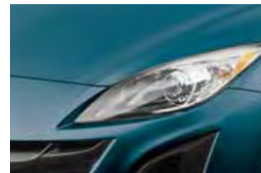
Gunmetal Blue Mica