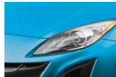
Celestial Blue Mica