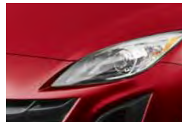
Copper Red Mica