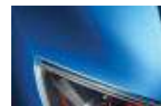
WINNING BLUE MICA