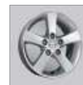
15" alloy wheels