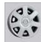
15" steel wheels