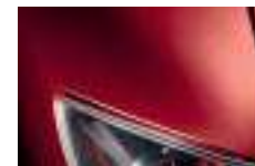
COPPER RED MICA