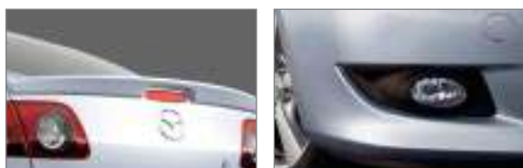
Pictured above from left to right: Rear lip spoiler, fog lights.