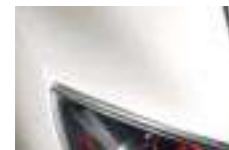
SNOW FLAKE WHITE PEARL