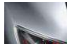
SUNLIGHT SILVER MICA