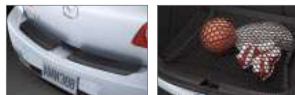
Pictured above from left to right: Rear bumper step plate, cargo net.