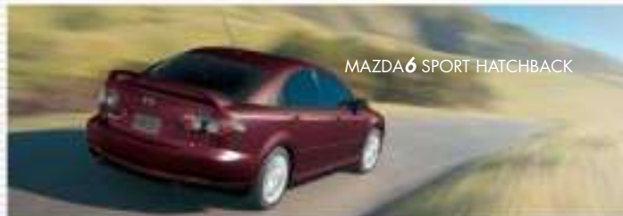
MAZDA6 SPORT HATCHBACK