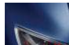
INDIGO BLUE MICA