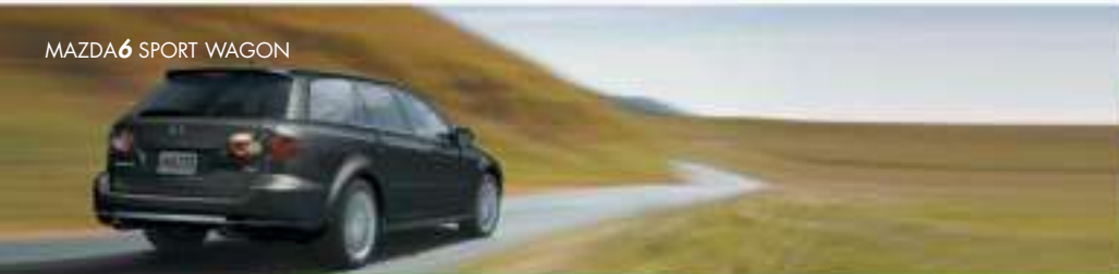
MAZDA6 SPORT WAGON