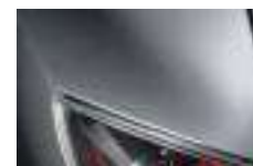
TITANIUM GREY METALLIC