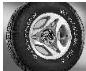
16-INCH ALLOY SE 4x4