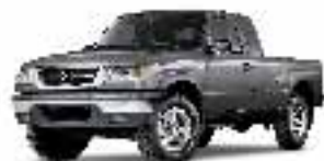
DARK TITANIUM METALLIC