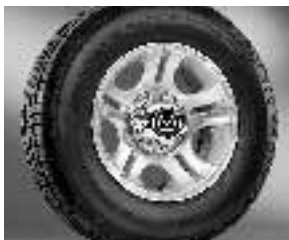
15-INCH ALLOY SE-5 Package