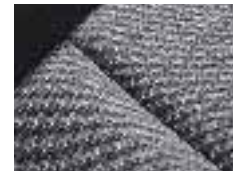
SE GRAY CLOTH with silver piping