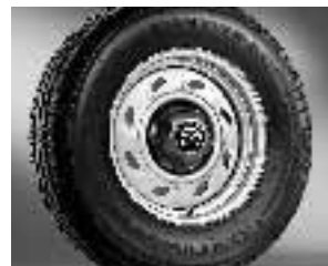
15-INCH STEEL Base 4x2