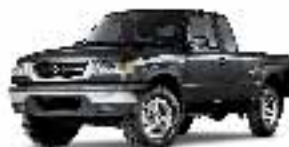
MYSTIC BLACK CLEARCOAT