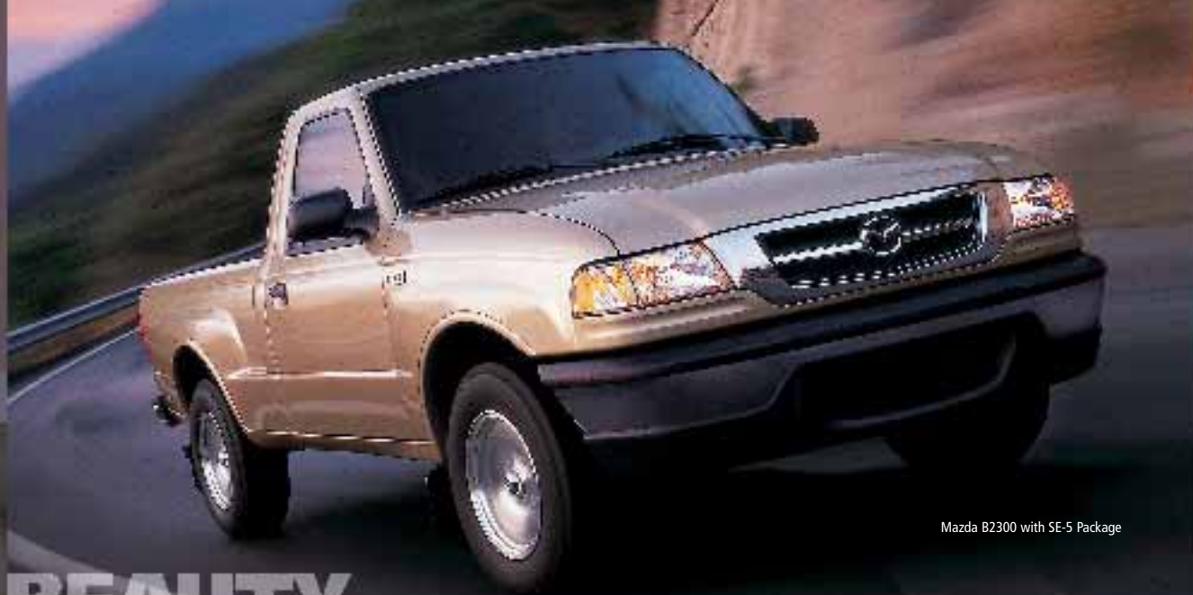
Mazda B2300 with SE-5 Package