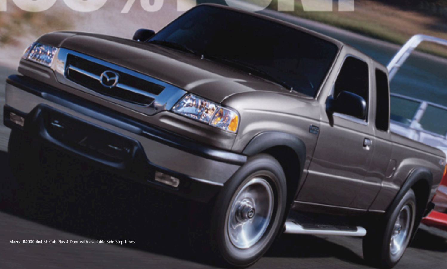
Mazda B4000 4x4 SE Cab Plus 4-Door with available Side Step Tubes

Want 4x4 versatility and tons of towing talent? Then you want a Mazda B4000 4x4 SE Cab Plus 4-Door. You'll enjoy a gutsy 4.0-liter V6 that generates 207 hp and 238 lb-ft of torque. An electronically controlled 5-speed automatic. The ability to shift on the fly into 4x4 mode (up to 45 mph). A maximum towing capacity of 5580 lbs. Striking 16-inch alloy wheels surrounded by beefy P255/70R16 all-terrain rubber. Fog lights and a protective bedliner. Even a frame-mounted trailer-hitch receiver. So climb into a Mazda B4000 cab today. And make the whole planet your playground.