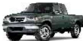
DARK SATIN GREEN METALLIC