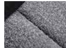
BASE/DUAL SPORT GRAY CLOTH with blue piping