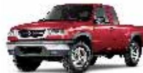
PERFORMANCE RED CLEARCOAT