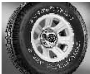
15-INCH STYLED STEEL Base 4x4