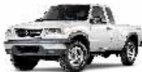
CLASSIC WHITE CLEARCOAT