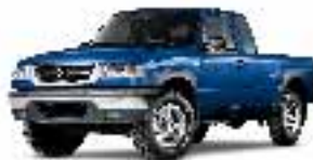
LAPIS BLUE METALLIC