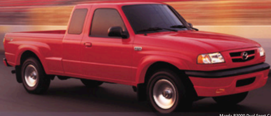
Mazda B3000 Dual Sport Cab Plus 4-Door

There's a Mazda B-Series Truck to provide power for any purpose. Take the Mazda B3000 Dual Sport Cab Plus 4-Door. It serves up a spirited, 3.0-liter V6 that churns out 148 hp and 180 lb-ft of torque. Aggressive P235/75R15 all-terrain tires. Gleaming 15-inch alloys. An AM/FM/CD stereo. The luxury of power windows, mirrors and door locks. And, like all Mazda trucks, the added confidence and security of a 4-wheel Anti-lock Brake System (ABS). This bad boy may run on gas, but it's fueled by testosterone.