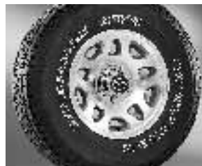
15-INCH ALLOY Dual Sport