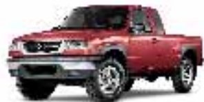
SUNBURST RED METALLIC