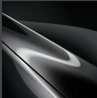
Machine Gray ^