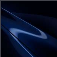
Deep Crystal Blue