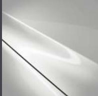
Rhodium White Premium +