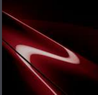
Artisan Red Premium ~