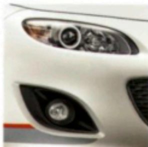
CRYSTAL WHITE PEARLESCENT*