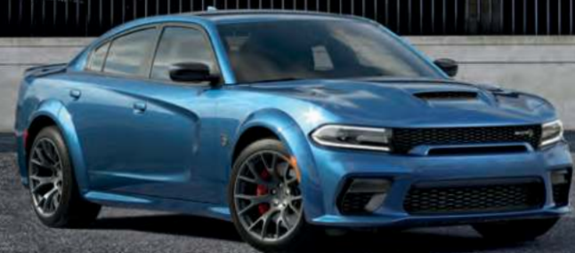
CHARGER SRT HELLCAT® REDEYE JAILBREAK // shown in Frostbite.