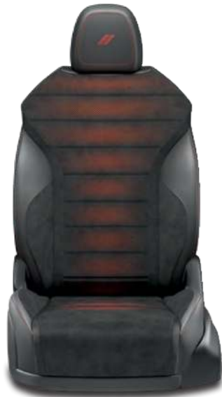
Perforated Alcantara® with Red Backing and Black Scuba Shark Bolsters with Red Accent Stitching (Included with Track Pack in Black)