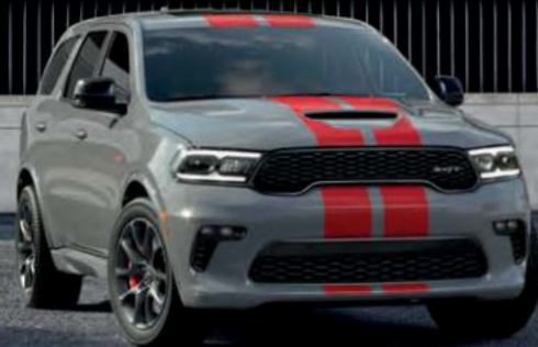
DURANGO SRT HELLCAT // shown in Destroyer Grey with available Flame Red dual stripes and SRT® Black Package.