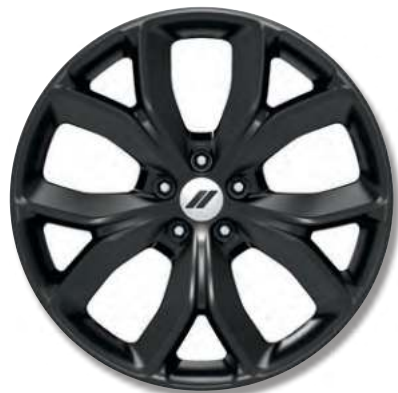
20-inch Abyss Finish // (WHN) Included with Track Pack