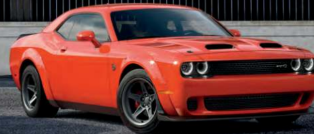
CHALLENGER SUPER STOCK // shown in Go Mango.