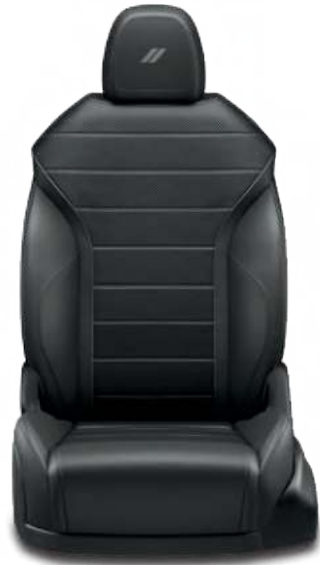
Perforated Leather Trim with Embroidered Dodge Logo and Black Stitching (Standard in Black)