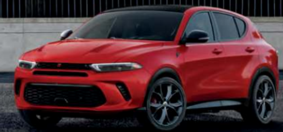
HORNET GT PLUS // shown in Hot Tamale with available Track Pack and Blacktop Package.