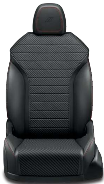
Cloth/Leatherette with Red Accent Stitching (Standard in Black)