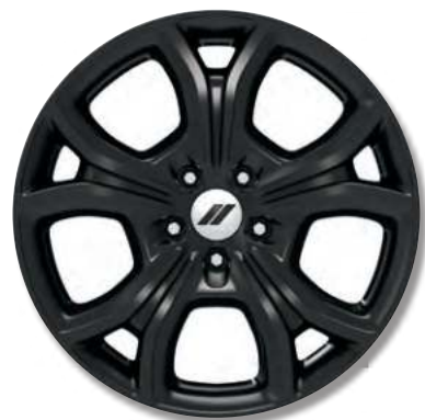
18-inch Abyss Finish // (WHG) Included with Blacktop Package