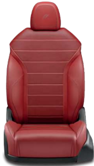
Perforated Leather Trim with Embroidered Dodge Logo and Red Stitching (Available in Red)