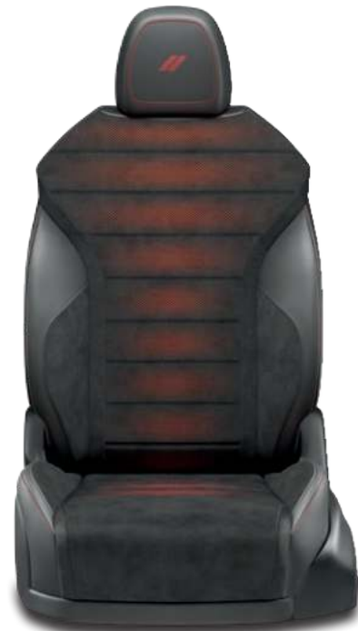
Perforated Alcantara® with Red Backing and Black Scuba Shark Bolsters with Red Accent Stitching (Included with Track Pack in Black)