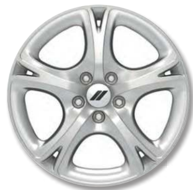
17-inch Silver // (WEF) Standard