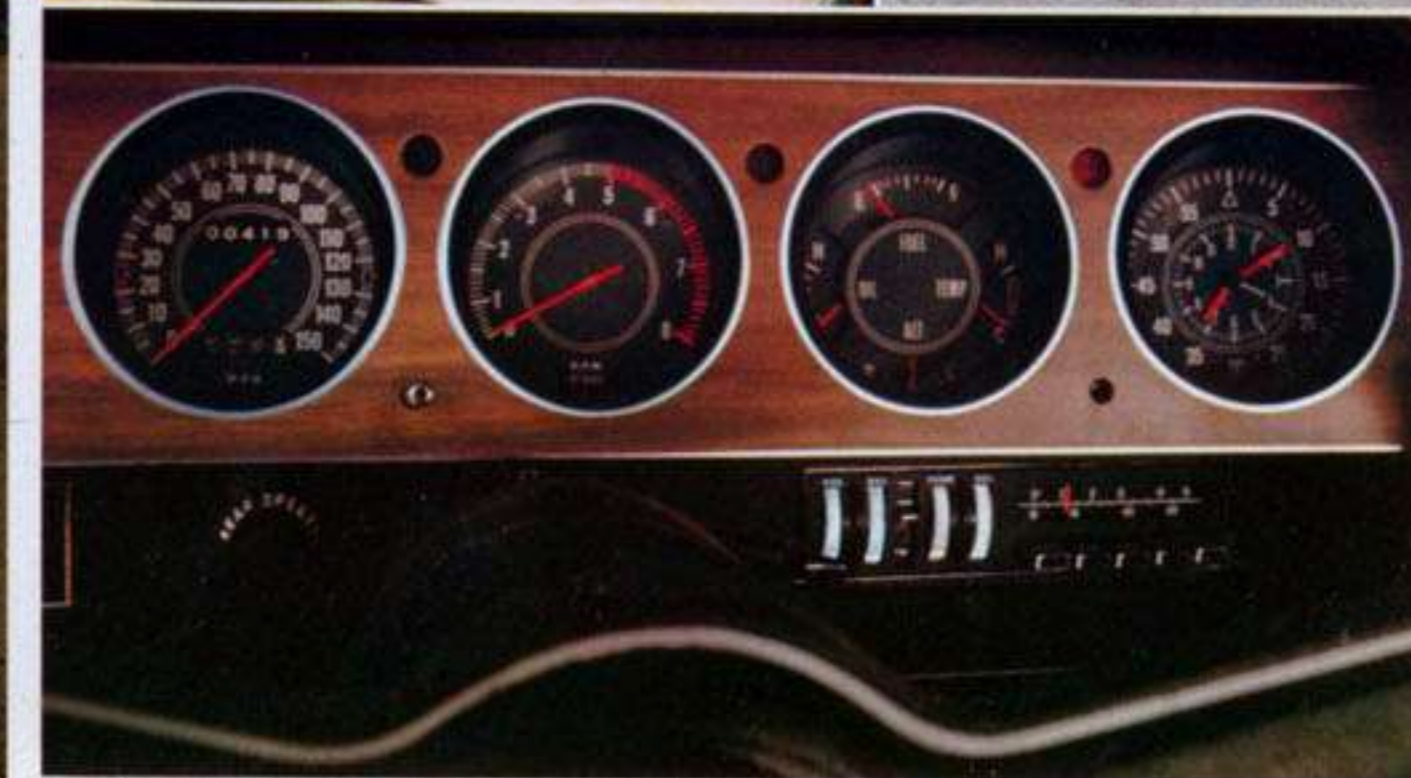
Nine-gauge lineup including trip odometer, tach, oil-pressure gauge, and clock.