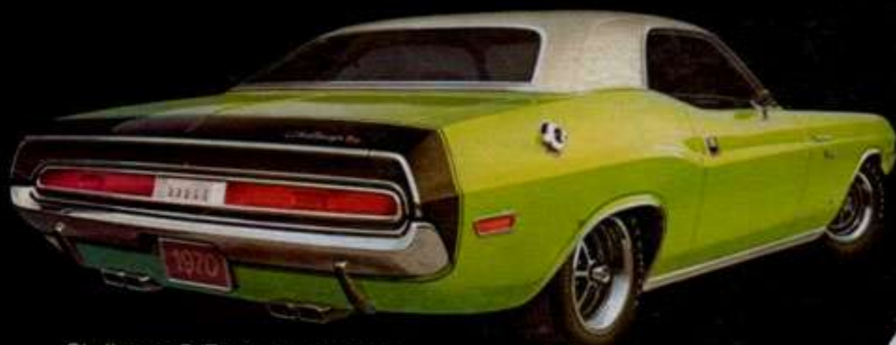
Challenger R/T two-door hardtop