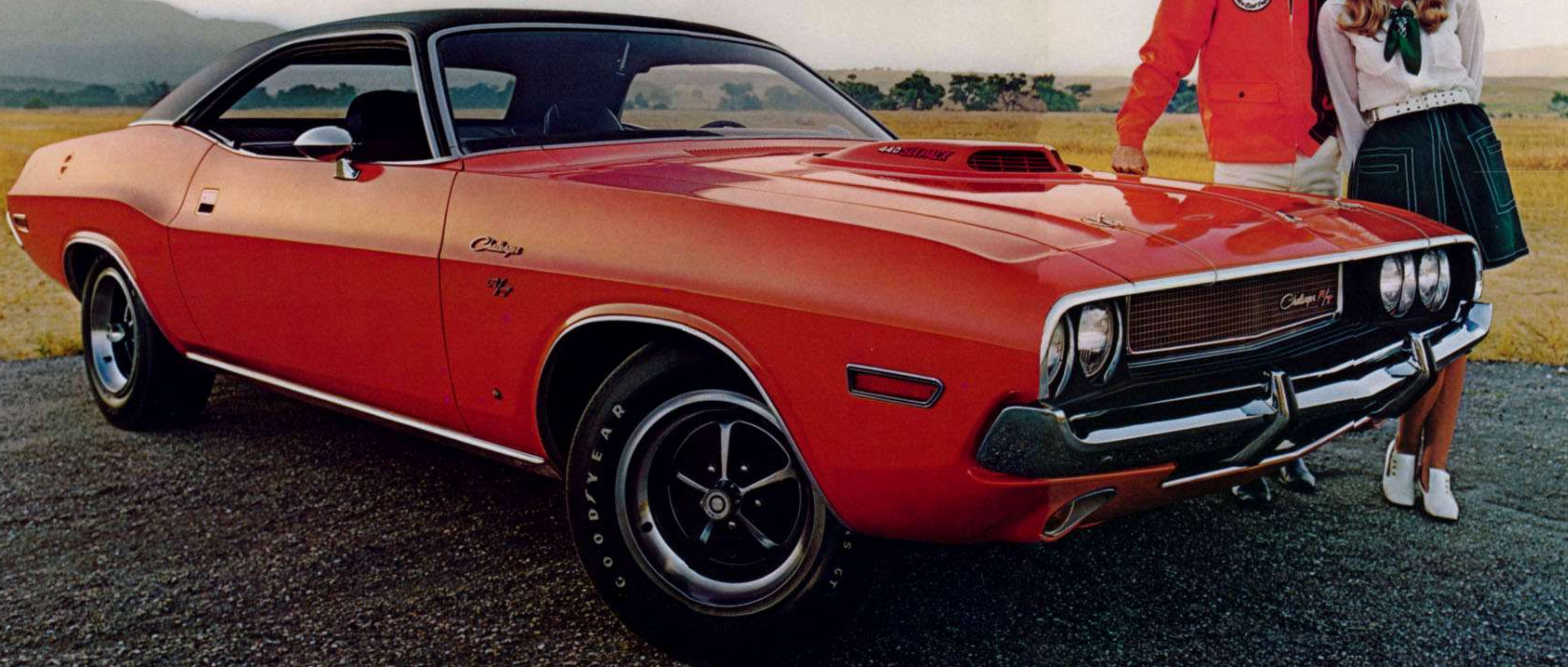
Challenger R/T with optional SixPack shown in Go-Mango.*

Three two-barrel carburetors, special intake, Daytona-type four-speed transmission, and Rallye Suspension, moulded around a race-ready 440 V8. They lurk under an optional shaker-type fresh air scoop. Supported by full gauges, contoured buckets with integral head restraints, and fiberglass-belted rubber. This is the stuff that image is made of.