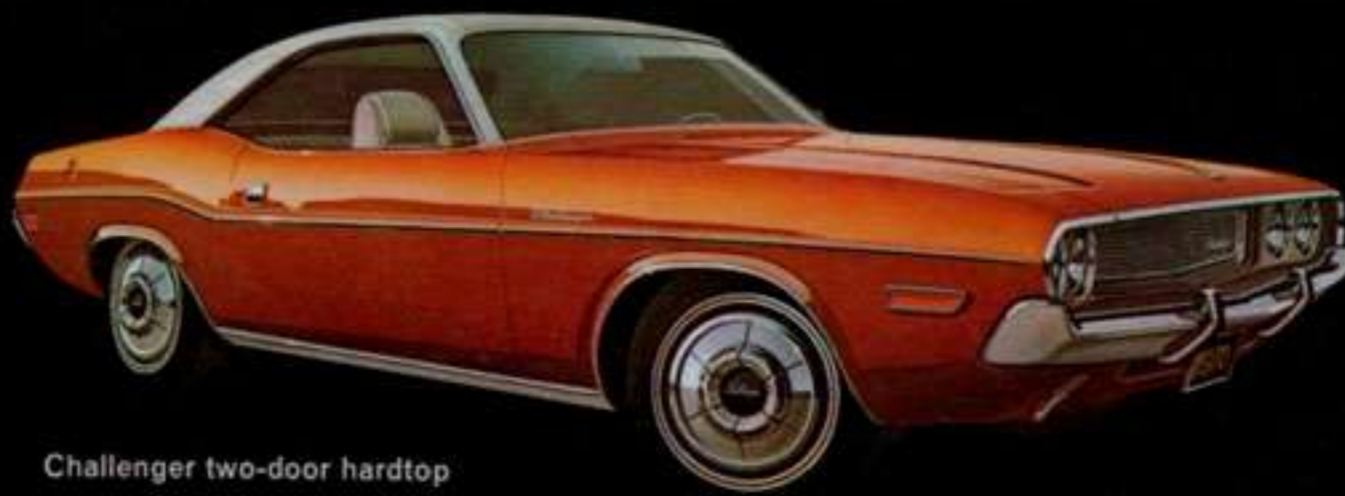
Challenger two-door hardtop