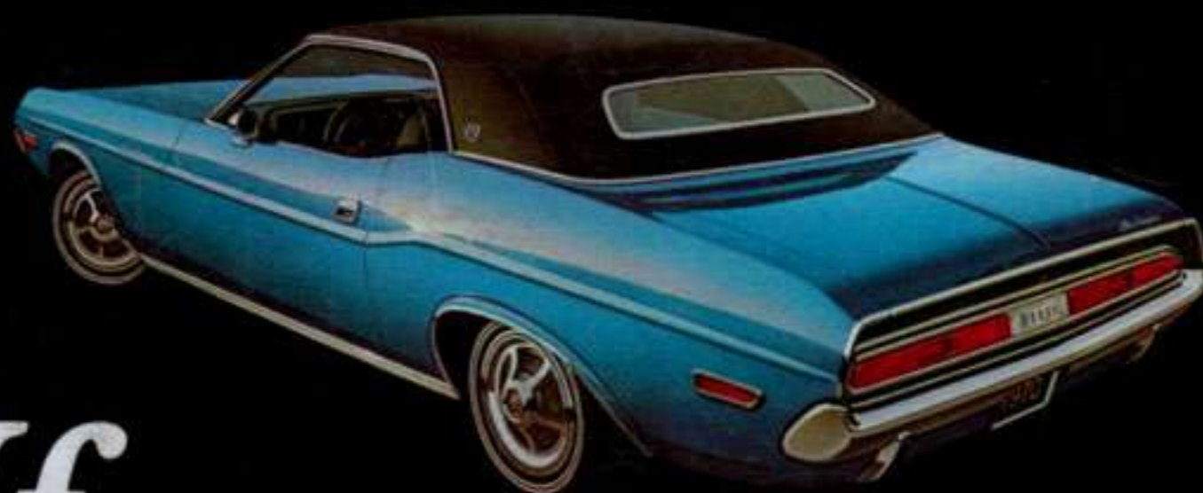
Challenger SE two-door hardtop

If you're the kind of person this car says you are, you could be Dodge Material.