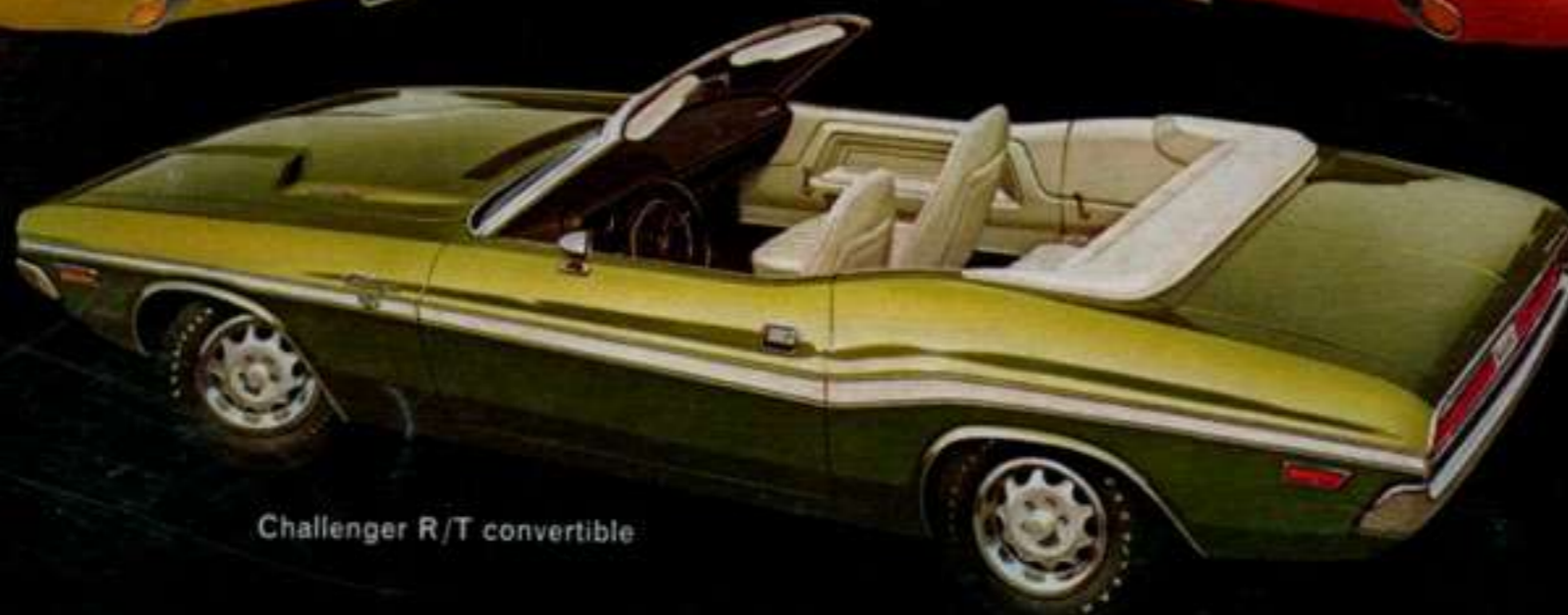
Challenger R/T convertible