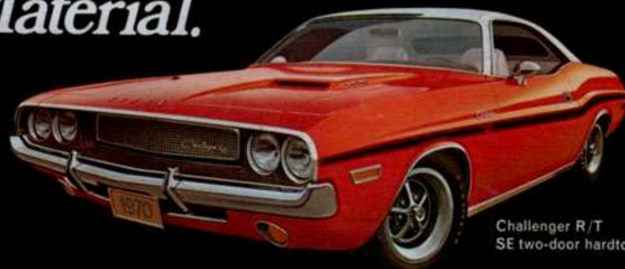
Challenger R/T SE two-door hardtop