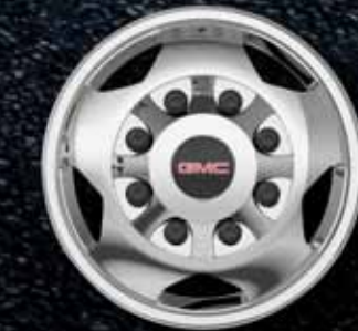
17" Polished Forged Aluminum (RS7) Standard on 3500 Denali HD DRW; Available on 3500HD Crew Cab DRW SLE and SLT