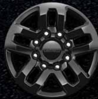
18" Black Painted Aluminum (RT4) Included and Only Available With All Terrain X Package