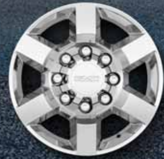
18" Chromed Aluminum (PYR) Standard on 2500HD SLT; Included on 2500HD All Terrain; Available on 2500HD SLE