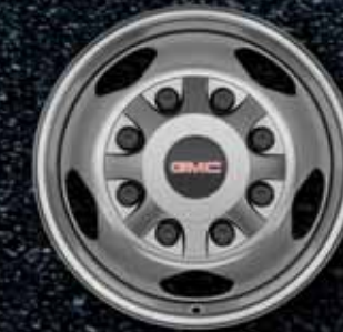
17" Painted Steel (PYW) Standard on 3500HD DRW Sierra