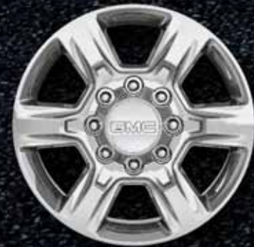
20" 6-Spoke Polished Aluminum (Q7R) Available on 2500HD SLT