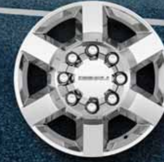
18" Chromed Aluminum (PYR) Standard on 3500 Denali HD SRW; Available on 2500 Denali HD