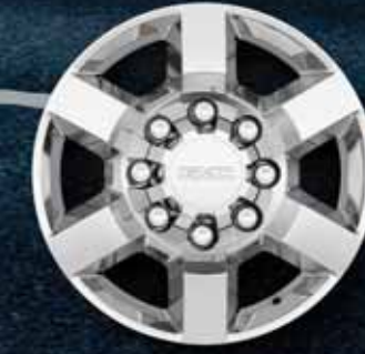
18" Chromed Aluminum (PYR) Standard on 3500HD SRW SLE and SLT; Included on 3500HD All Terrain