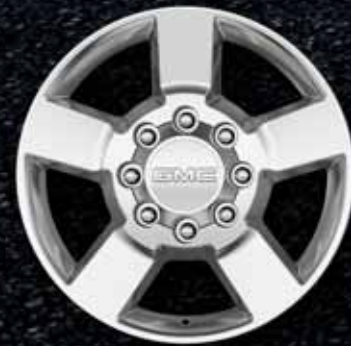
20" 5-Spoke Polished Aluminum (PYU) Available on 2500HD SLE