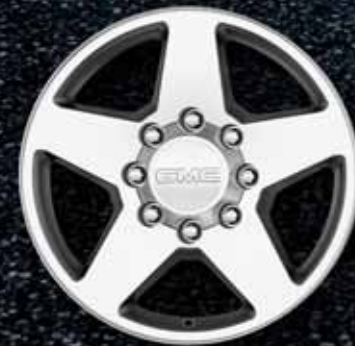
20" 5-Spoke Polished Aluminum With Dark Argent Accents (RTH) Available on 2500HD All Terrain