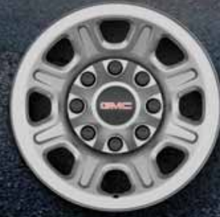
18" Painted Steel (PYT) Available on 2500HD Sierra