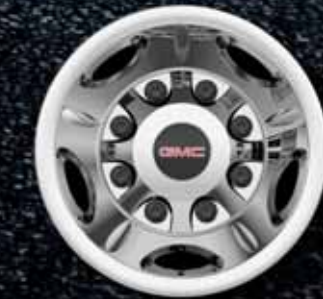
17" Painted Steel With Chrome Overlay (P06) Standard on 3500HD DRW SLE and SLT