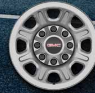
18" Painted Steel (PYT) Standard on 3500HD SRW Sierra