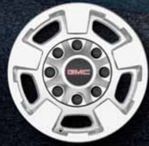
17" Machined Aluminum (PYQ) Standard on 2500HD SLE; Available on 2500HD Sierra