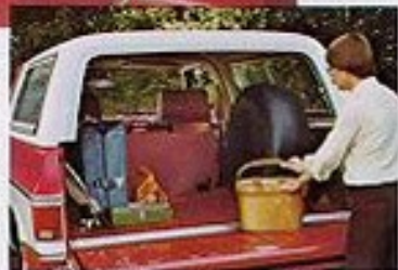
Big cargo area is accessible from fold-down tailgate.

High Sierra instrument cluster has bright finish with black trim and substitutes voltmeter, engine temperature and oil pressure gauges for warning lights. This interior also includes special front door trim and rear sidewall trim panels with ashtrays.