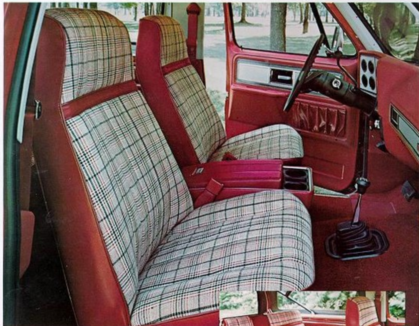
High Sierra interior with center console and available rear seat.