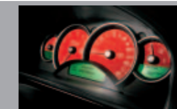
Redhot instrument cluster