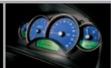
Turismo instrument cluster