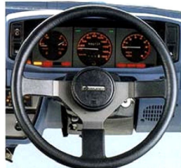
Sports 3-spoke steering wheel.