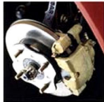
Power disc brakes.

And with the better than average 4.6 metre turning radius, it's also one of the easiest hatches to park.