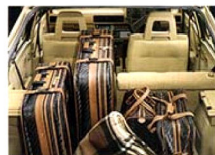
Split fold rear seats.