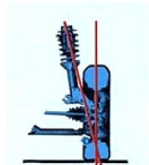
Negative scrub radius front suspension.