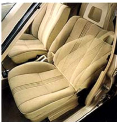
Reclining front bucket seats.

There's also an intermittent wiper mode, remote control for both exterior mirrors and a magnificent AM/FM electronic-tune radio with 2 speakers to surround you with your favourite music.