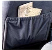
Storage pocket in rear of front seats.