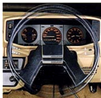
Tilt adjustable steering column.

In front of you there's a soft-feel steering wheel which is tilt adjustable, instruments that include fuel and temperature gauges, plus warning lights for oil pressure, brake and alternator failure, and one to let you know the handbrake is on.