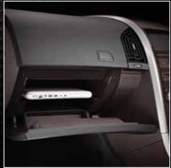
LAPTOP HOLDER IN GLOVE BOX