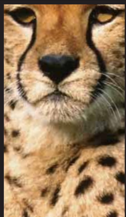
POUNCING CHEETAH-INSPIRED BODY LINES