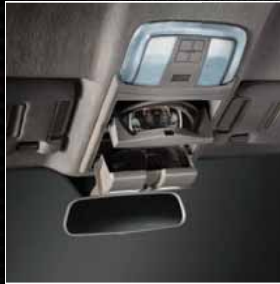
SUNGLASSES HOLDER AND CONVERSATION MIRROR