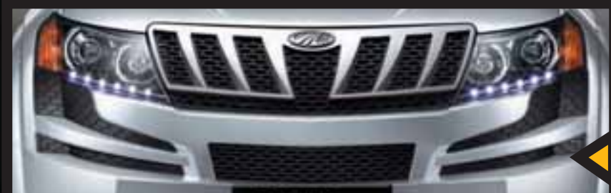
JAW-LIKE FRONT GRILLE