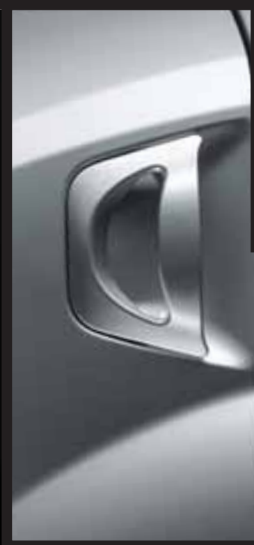
PAW-STYLED DOOR HANDLES