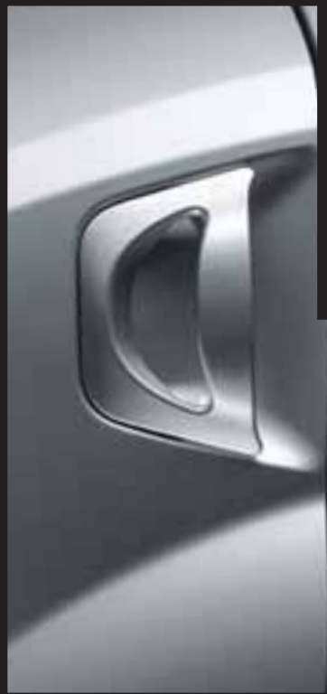
PAW-STYLED DOOR HANDLES