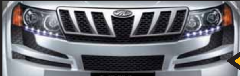
JAW-LIKE FRONT GRILLE