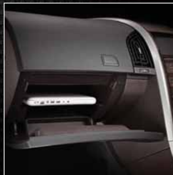
LAPTOP HOLDER IN GLOVE BOX