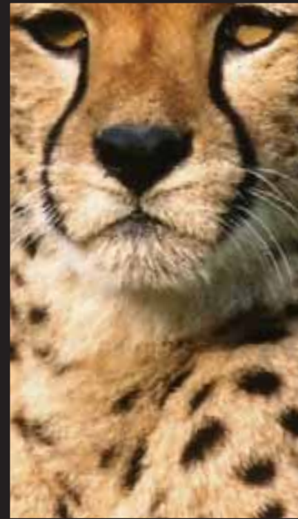
POUNCING CHEETAH-INSPIRED BODY LINES