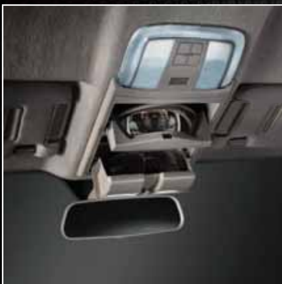
SUNGLASSES HOLDER AND CONVERSATION MIRROR