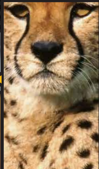
POUNCING CHEETAH-INSPIRED BODY LINES