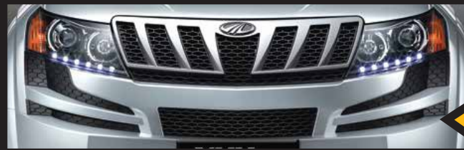
JAW-LIKE FRONT GRILLE