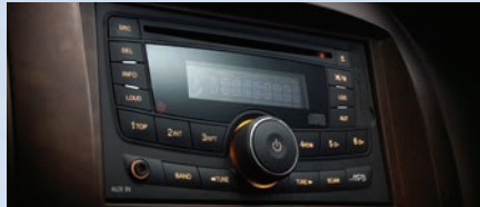
> 2-DIN music system with Bluetooth technology to sync with your phone for hands-free operation.