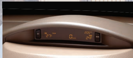
> The Digital Drive Assist System (DDAS) for real time updates on the Xylo's speed, mileage, temperature and more.