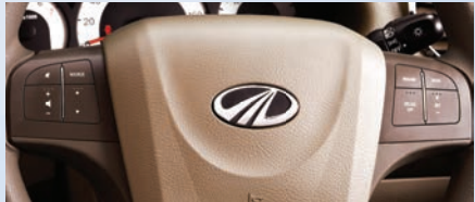
> The Voice Command Technology (VCT) allows you to control the Xylo with mere words.