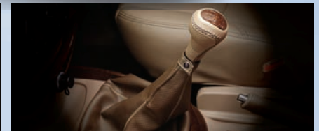
> The all-new 5MT320 Transmission makes shifting gears effortless.