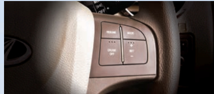
> Cruise Control maintains vehicle speed, relieving your leg.