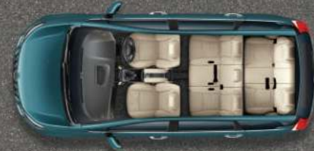
8-Seater with 60:40 Split in Middle Row