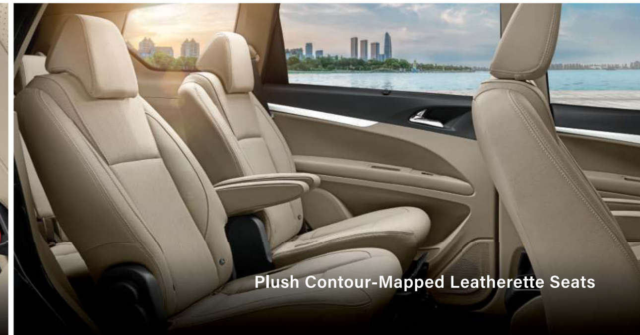
Plush Contour-Mapped Leatherette Seats