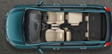
3 rd Row with 60:40 Split and Flat Fold (In 7-Seater & 8-Seater)