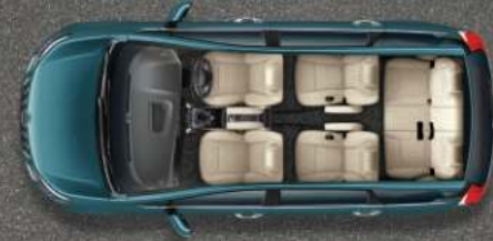
7-Seater with Captain Seats in Middle Row