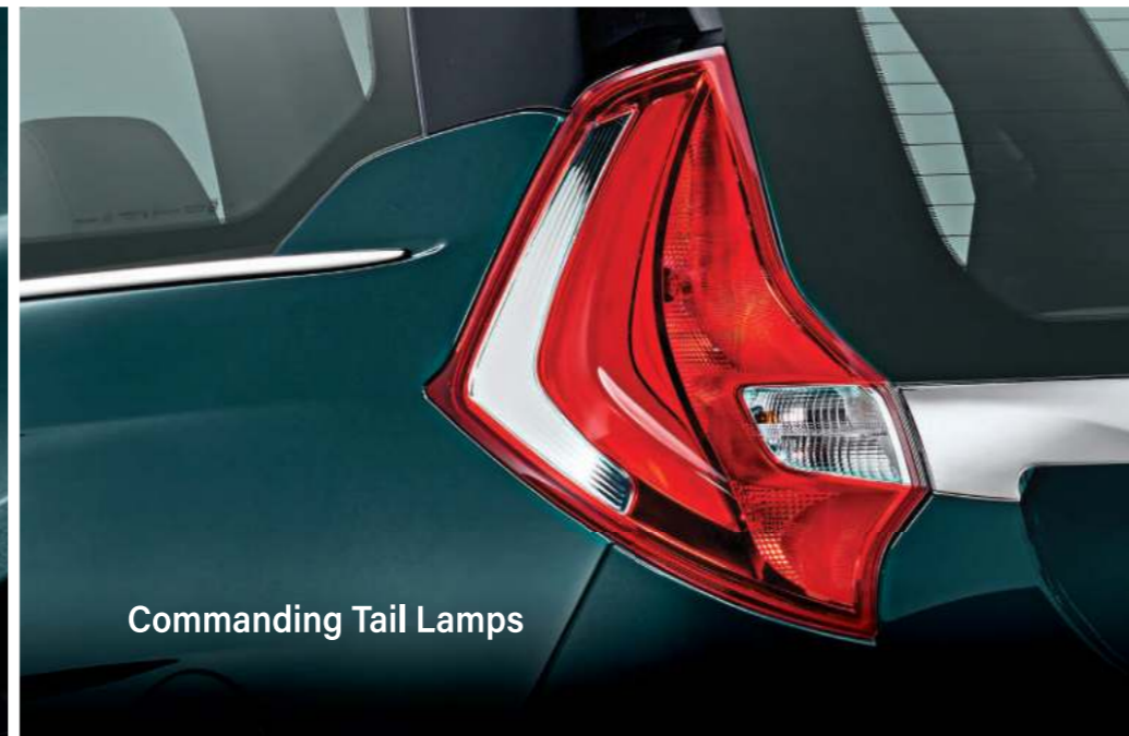
Commanding Tail Lamps