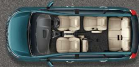
Single Touch Tumble Down in Middle Row Co-Driver Seat (In 7-Seater & 8-Seater)