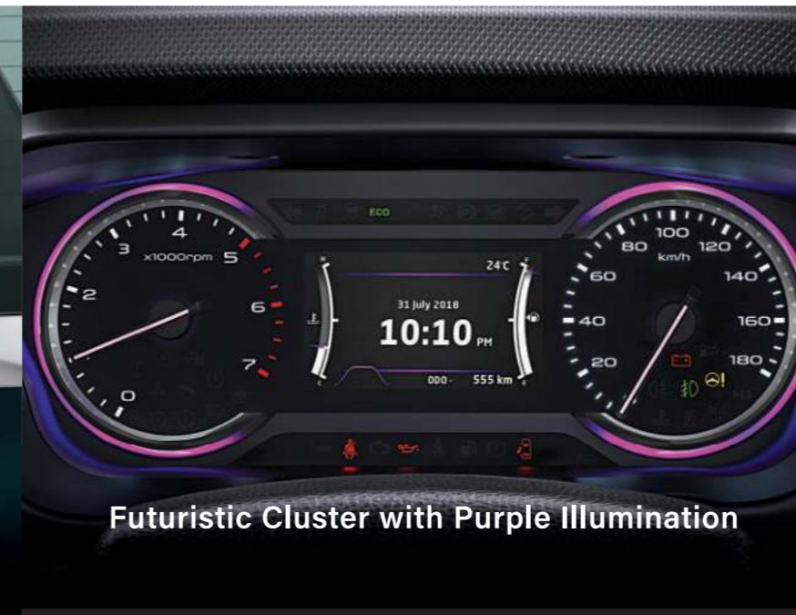
Futuristic Cluster with Purple Illumination