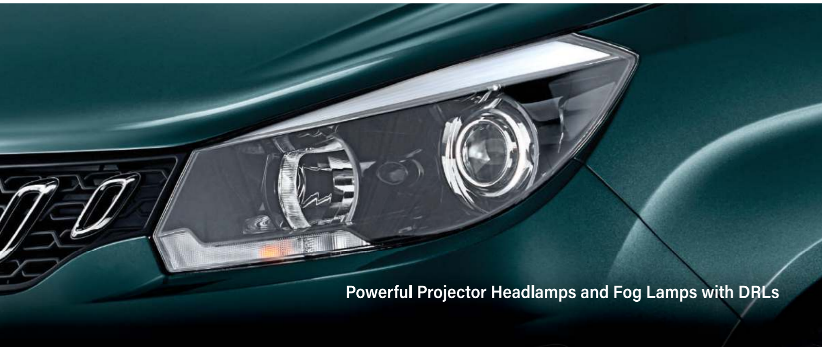
Powerful Projector Headlamps and Fog Lamps with DRLs

▲ Dual-Tone Dashboard ▲ First-in-Class Sun Shade in the 2 nd Row ▲ Lumbar Support and Height Adjuster for Driver's Seat