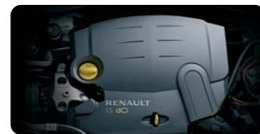
1.5 L dCi CRDi ENGINE FROM RENAULT

The practicality of a Verito holds true for its on-road performance too. The responsive power steering, high ground clearance and modern suspension keep the drive quality high. While the renowned Renault CRDi engine keeps fuel efficiency high too. All this, while the convenience of a Driver Information System giving you live information about your car's performance.