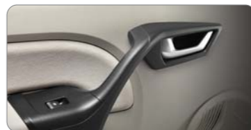
NEW DESIGNED GRAB HANDLES