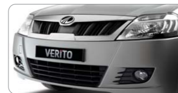
CHROME-PLATED FRONT GRILLE

The Verito has always been the sedan of choice for men who value substance over style. But who says you can't have both? Presenting the new-look Verito. Sophisticated bends, masculine body lines and bold cuts give the car an elegant new look. While re-designed interiors round off the experience. Now the sensible sedan gets the stylish air it deserves.