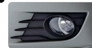
STYLISH NEW FOG LAMPS