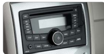
2-DIN MUSIC SYSTEM WITH CD/MP3/USB/AUX-IN