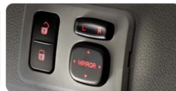
ELECTRIC ORVM CONTROLS