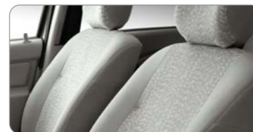
ELEGANT NEW UPHOLSTERY

The cabin of the new Verito is as roomy and comfortable as it has always been. But everything from the centre console to the door trims have been re-designed. Every feature has been tweaked to feel even more convenient. And the new dashboard lends a contemporary and refined two-tone theme to the entire cabin.