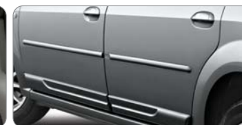
SIDE IMPACT BEAMS