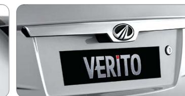
CHROME REAR APPLIQUE