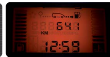
DRIVER INFORMATION SYSTEM