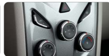
VARIOMETRIC AC WITH ERGONOMIC CONTROLS