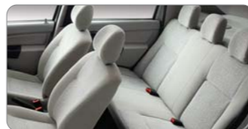
WIDEST REAR SEAT WITH THREE HEAD RESTRAINTS