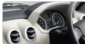
TWO-TONE INSTRUMENT PANEL