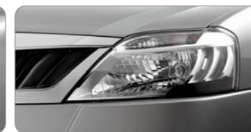
NEW EYEBROW HEADLIGHTS