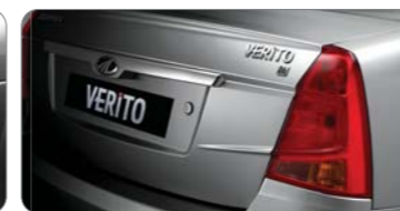
SCULPTED NEW BOOT LID & CLEAR LENS TAIL LAMPS