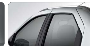
STYLISH ROOF RAILS & BLACKENED PILLARS