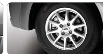
CLASSY NEW ALLOY WHEELS