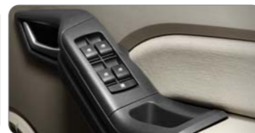
DOOR-MOUNTED POWER WINDOW SWITCHES