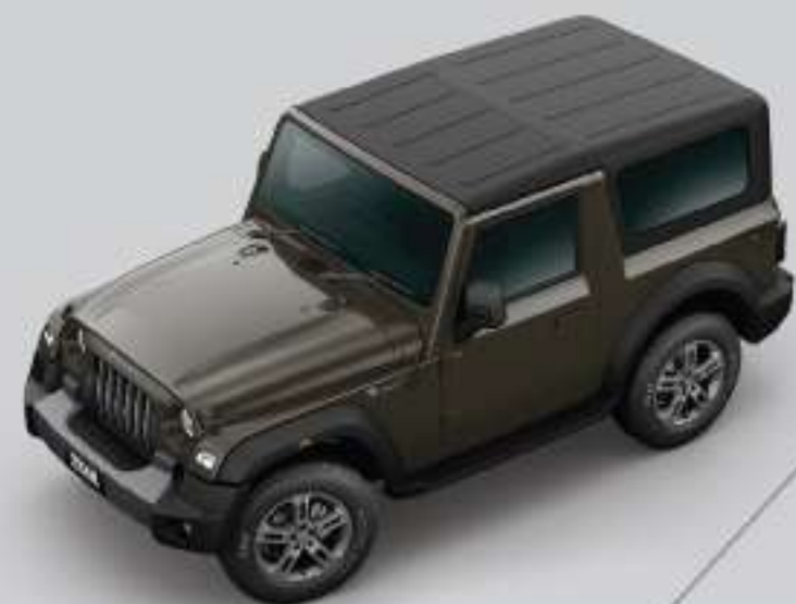
△ ROCKY BEIGE