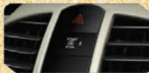
MICRO HYBRID TECHNOLOGY