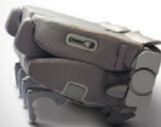
100% SINGLE DUMP