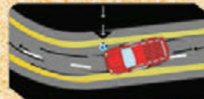
ANTI-LOCK BRAKING SYSTEM WITH EBD

Say goodbye to anxiety on weekend roadtrips. Thanks to the dual SRS airbags, Anti-Lock Braking System with EBD, Intellipark Reverse Assist and other safety features integrated into the Quanto.