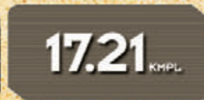
ARAI CERTIFIED MILEAGE