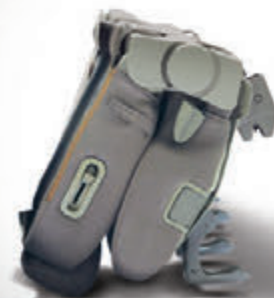
100% DOUBLE DUMP