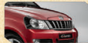
ROBUST FRONT FASCIA

The Quanto leaves no doubts about its SUV lineage. You can see it in its masculine front grille, distinct alloy wheels, and high ground clearance. Its high sitting position gives the driver a commanding view of the road. While its sporty roof rails and tailgate mounted spare wheel lend it a true SUV character.