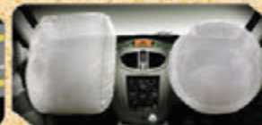
DUAL AIR BAGS