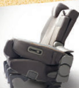
40% SINGLE DUMP