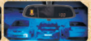
INTELLIPARK REVERSE ASSIST SYSTEM