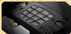
1.5 L mCR100 ENGINE

The Quanto whips out 100 PS, courtesy the mCR100 engine. Twin-stage turbo chargers find their way into an Indian engine for the first time. And make it generate a massive torque of 240 Nm. But surprisingly this engine's not a guzzler. Its Micro Hybrid Technology keeps a tight leash on fuel consumption.