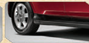
HIGH GROUND CLEARANCE