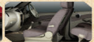
HIGH SITTING POSITION