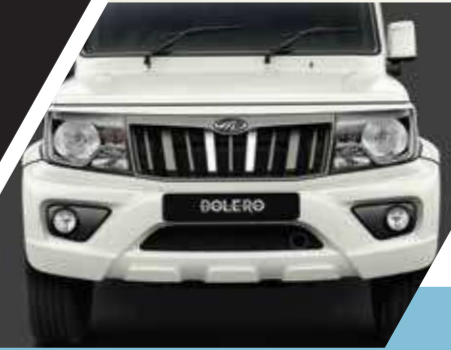
The only vehicle in India with metal bumpers to comply with pedestrian protection norms