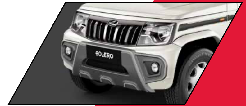
Front Bumper Add On