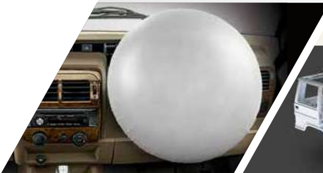
Airbag for additional safety