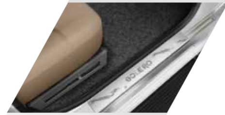
Special Edition Scuff Plate Set

Deck the vehicle with the meticulously designed accessories to get complete control and comfort to take on the tough roads ahead.