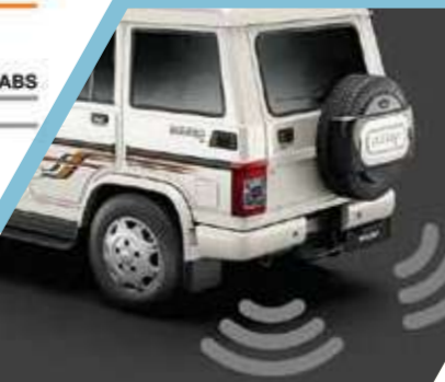
Vehicle reverse parking alert sensors*