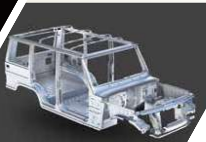
Tough & rugged body shell with a frame based construction