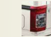
New clear lens tail lamps

Stylishly designed exteriors that complement the toughness of the vehicle.