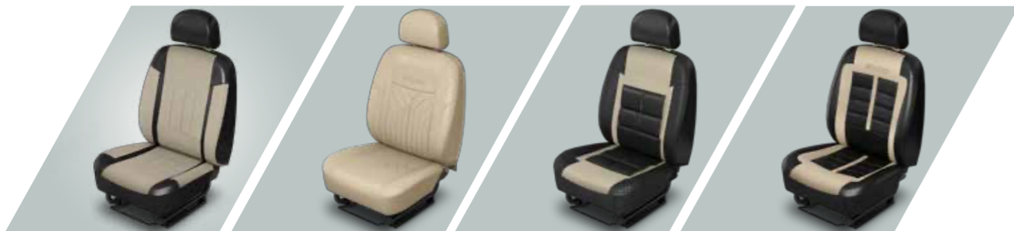
Beige Black PU Seat Cover

Also Available: • Full Floor Lamination Mat • Black PVC Floor Mat