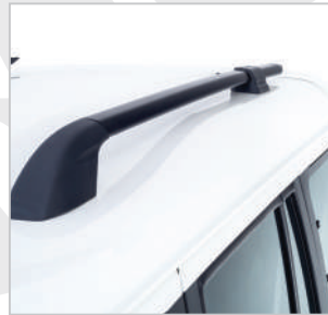
ROOF RACKS INCLUDED