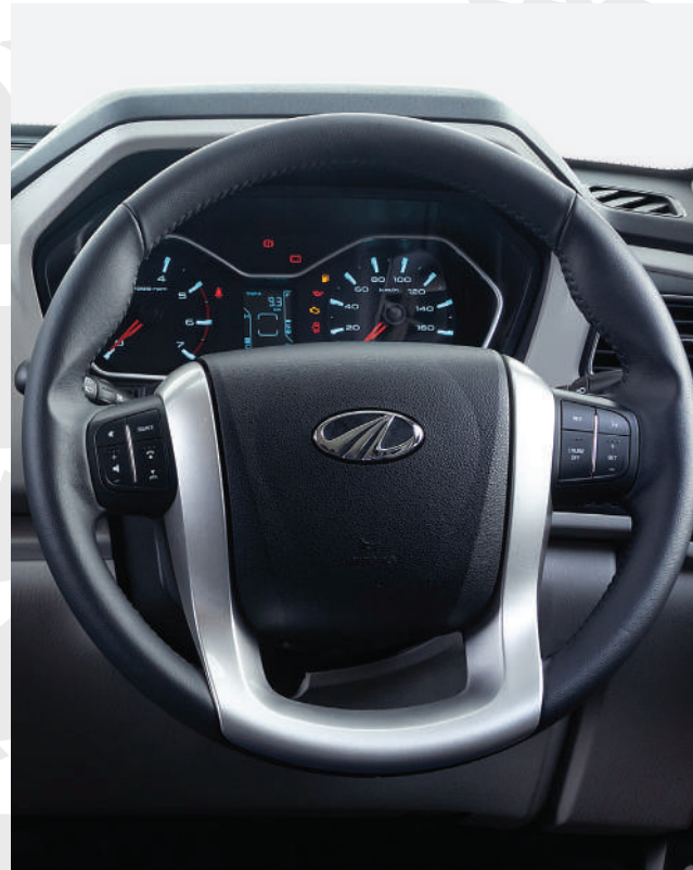
FAUX LEATHER-WRAPPED STEERING WHEEL AND GEAR SHIFT