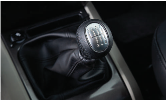
SIX-SPEED MANUAL GEAR SHIFT AND LOW-RANGE/HIGH-RANGE SELECTION (4X4 ONLY)