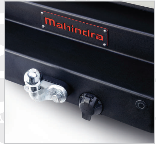
REAR BUMPER, BLACK OFF-ROAD STEEL WITH TOW BAR