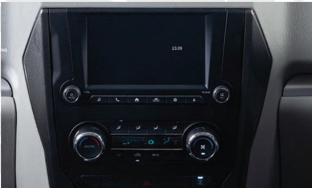
7" TOUCHSCREEN INFOTAINMENT CENTRE WITH BLUETOOTH, AUX AND USB CONNECTIVITY IN ADDITION TO GPS NAVIGATION AND REAR-PARK ASSIST