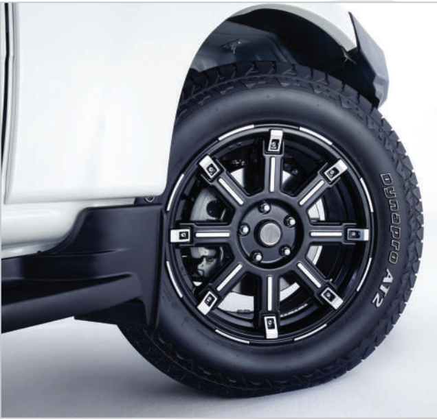
17INCH ALLOY WHEELS, SILK BLACK MACHINED EDGE