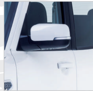
ORVMS WITH SIDE TURN INDICATORS