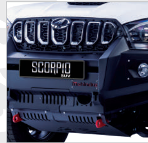
FRONT BUMPER, BLACK OFF-ROAD STEEL