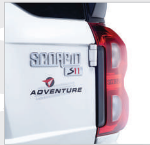
AUTOMATICALLY ACTIVATED HAZARD LIGHTS IN CASE OF SUDDEN BRAKING