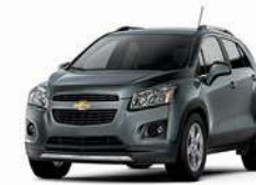
GBV - CYBER GREY METALLIC