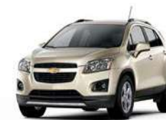
GWT - CHAMPAGNE SILVER METALLIC