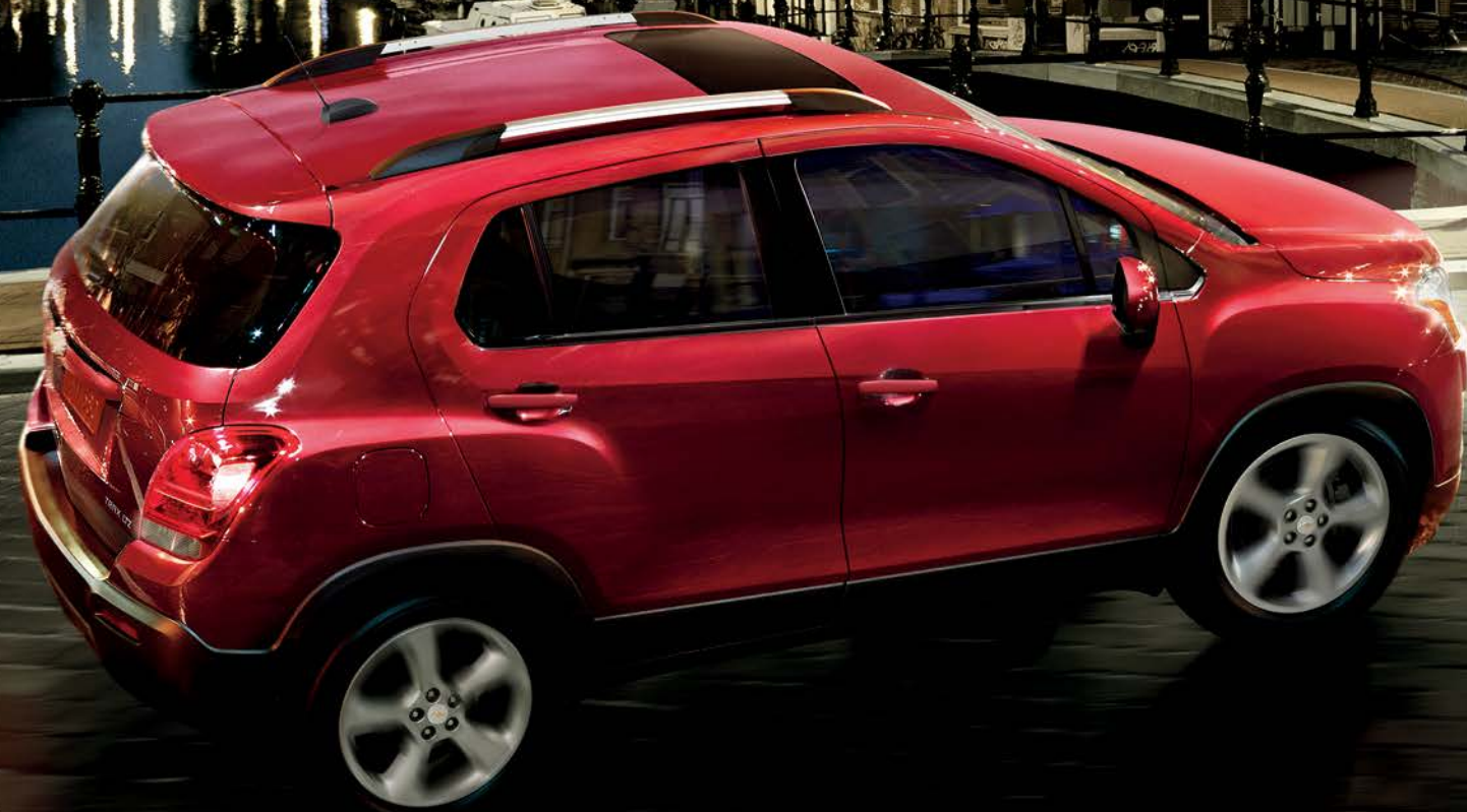
Trax LTZ in Victory Red with available features.

TAKE ON THE CITY. Trax has the elevated vantage point of an SUV and the agile handling of a compact car. Its wide stance and available all-wheel drive give you the confidence to handle any season and anything your week throws at you.