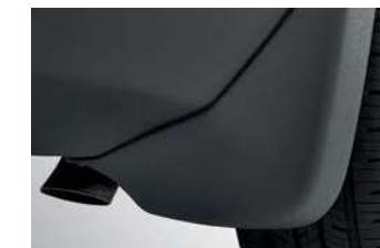
Moulded Rear Splash Guards