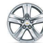
16" Aluminum (Standard on 1LT and 2LT)