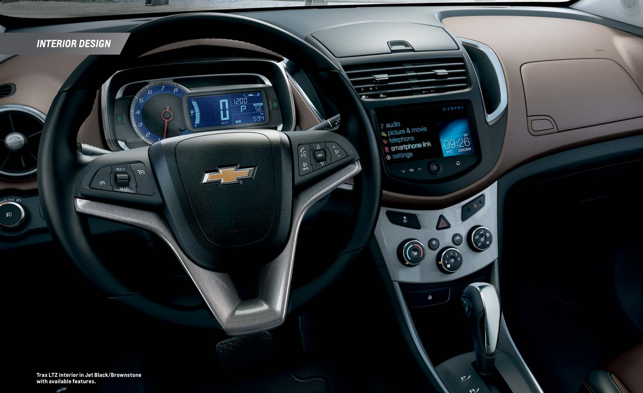
Trax LTZ interior in Jet Black/Brownstone with available features.

INTERIOR COMFORTS. Step inside Trax and you'll find everything you need to make the road trip of life as pleasant as a five-block commute. The comfortably appointed interior is your customizable cockpit for taking on the city.