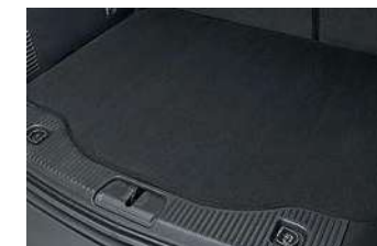
All-Weather Cargo Mat

PERSONALIZE YOUR TRAX AT GMACCESSORIES.CA