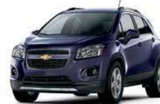
G7U - PLUMBERRY METALLIC