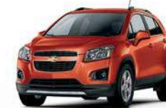
G8F - SUNSET ORANGE METALLIC