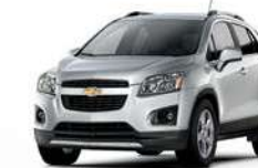
GAN - SILVER ICE METALLIC