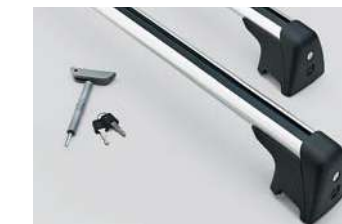
Roof Cross Rail Package