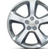
18" Aluminum (Standard on LTZ)