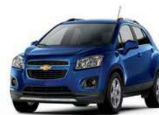
GTS - BLUE TOPAZ METALLIC