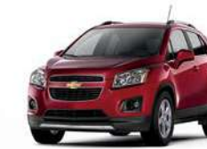
GCE - SONOMA JEWEL METALLIC