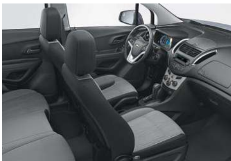
Jet Black/Light Titanium-Colour Deluxe Cloth 2