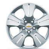
16" Wheel Cover (Standard on LS)