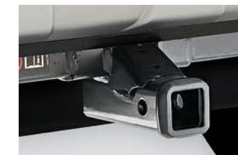
Sports Equipment Carrier Mount