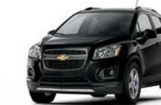
GAR - BLACK GRANITE METALLIC 5