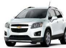
GAZ - SUMMIT WHITE