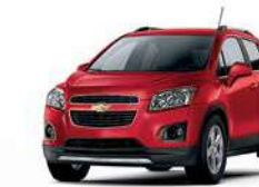
GCN - VICTORY RED