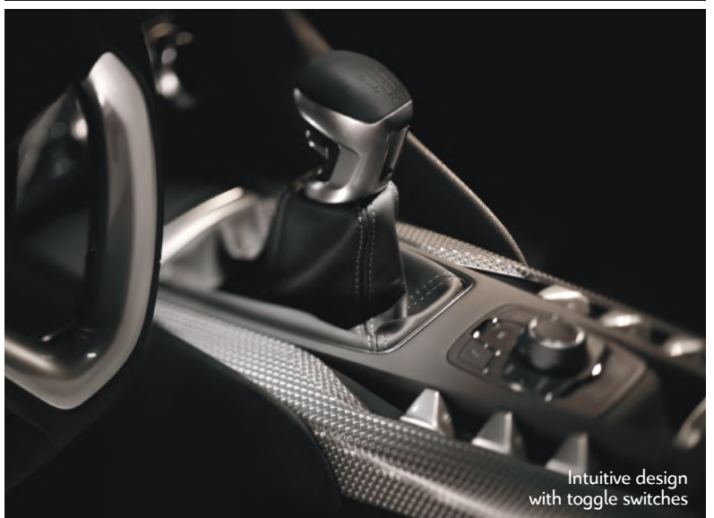
Intuitive design with toggle switches