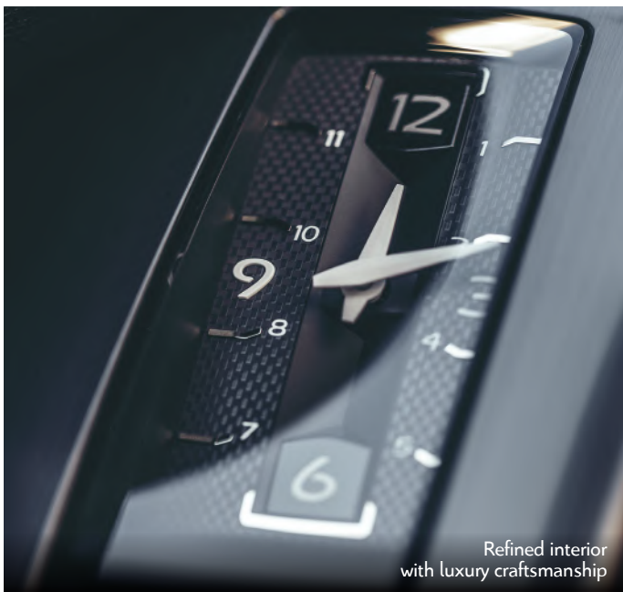
Refined interior with luxury craftsmanship