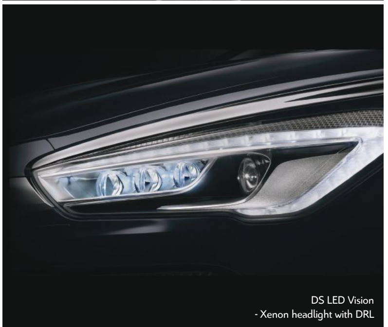
DS LED Vision - Xenon headlight with DRL

The new DS 5 has a vast array of talents and advancements tailored to enhance the lifestyles of its discerning owners. Whether it's a daily drive to work, a night out in the city or a weekend to the countryside - the sensational new DS 5 will get you there safely, efficiently, luxuriously, and in superb style