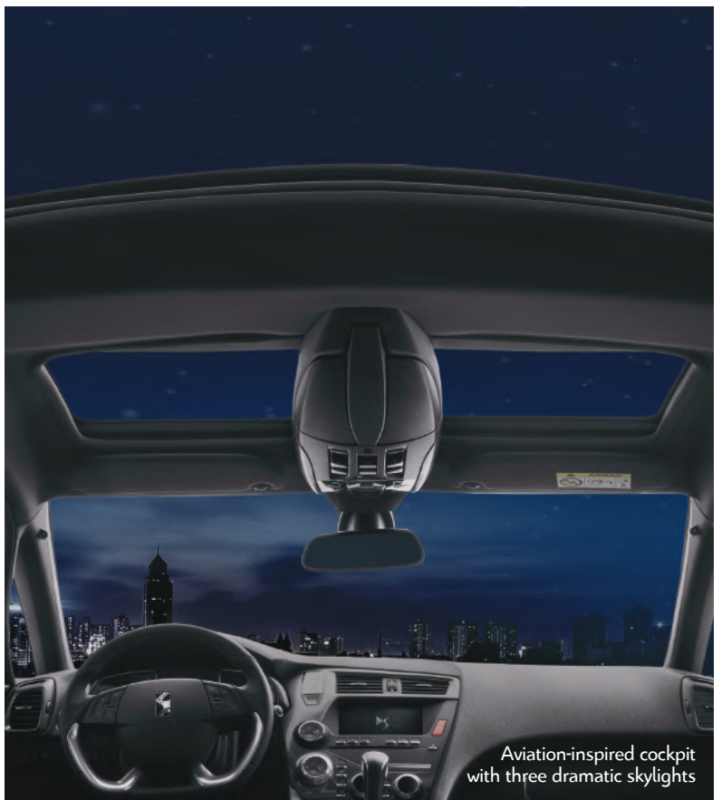
Aviation-inspired cockpit with three dramatic skylights