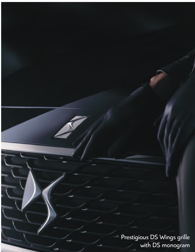
Prestigious DS Wings grille with DS monogram