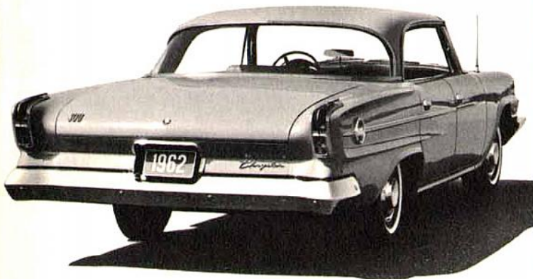
300 FOUR-DOOR HARDTOP combines full-size family room and comfort with hot-blooded 300 performance! All-vinyl interior is optional.

Drive and price a new Chrysler 300. Compare it with the competitive sports-type cars the 300 has inspired. You'll settle for nothing less than the genuine article—one of the great 300's by Chrysler!