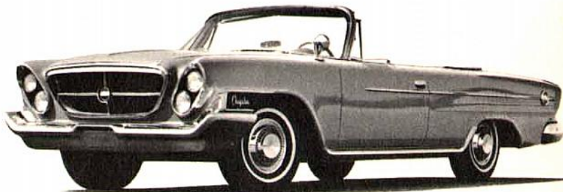
300 CONVERTIBLE features as standard equipment individual bucket seats and center arm rests in front with bucket-style bench seat in rear, all in genuine leather and seating six passengers comfortably.

*Because the Chrysler 300 series are precision-engineered, high-performance automobiles, not all engines, transmissions, interiors and other options or combinations thereof, are available on every model. Ask your Chrysler dealer for exact specifications to help you choose your new 300.