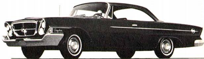
The 300 TWO-DOOR HARDTOP offers the same bucket seat arrangement as the convertible, optional at extra cost.

THESE stout new Chryslers let you custom-order the exact combination of performance and luxury you want. Pick from three potent FirePower engines—the FirePower 305, the FirePower 340 or the FirePower 380 (the same that pushes the H!). Choose either bench-type seats in cloth-and-vinyl or all-vinyl—or bucket front seats in genuine hand-rubbed leather. There's a wide variety of other options to choose from, too—including stick shift or pushbutton Torque-Flite transmissions.*