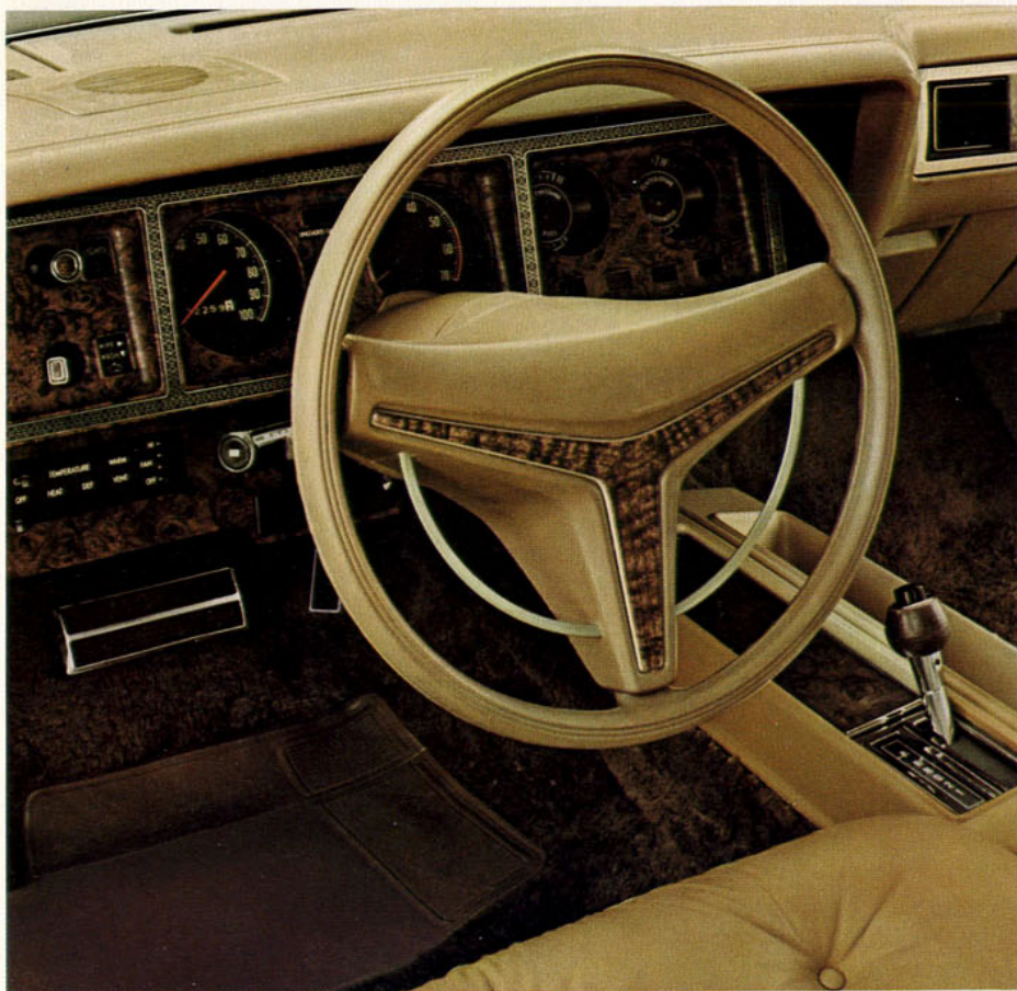
Cordoba instrument panel. The emphasis is on making the driver's job easier.