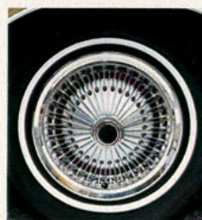
Wire wheel cover