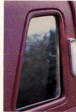
Opera window with lamp