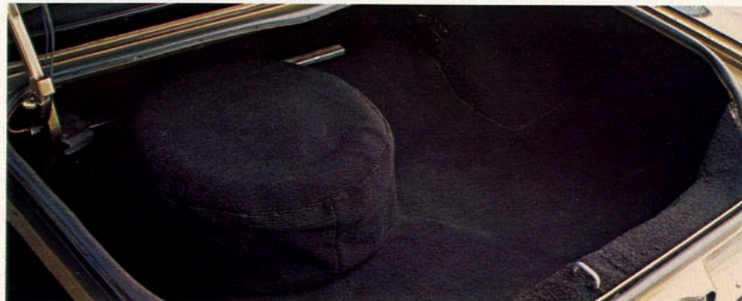
The standard fully carpeted trunk protects your luggage.