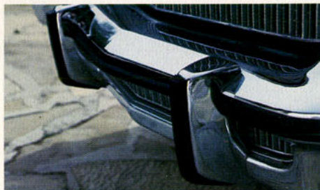
The standard integrated front bumper guard

Each of these optional features add those extra touches to Cordoba's luxurious and functional environment.