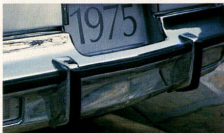
The standard rear bumper guard