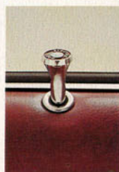
Power door locks