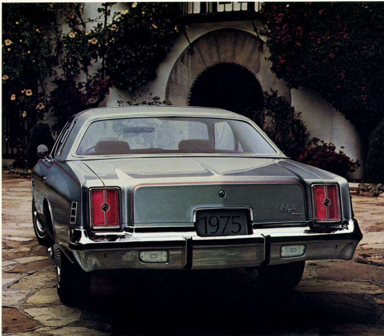
Clean, classic looks with integrated bumper design—the new small Chrysler.

new, personalized automobile. Important details like new door seals, for example, are designed to minimize road noise. Careful attention has also been given to the Cordoba's entire suspension system. Front and rear sway bars, spring rates and tires have been painstakingly selected. Rubber bushings at strategic mounting points—and many other components of Chrysler's highly respected TorsionAire Ride—impart a smoothness that informs you immediately that Cordoba knows how to handle any road.