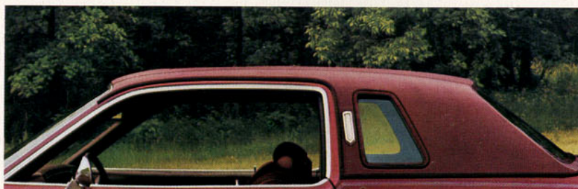
The distinctive Halo roof