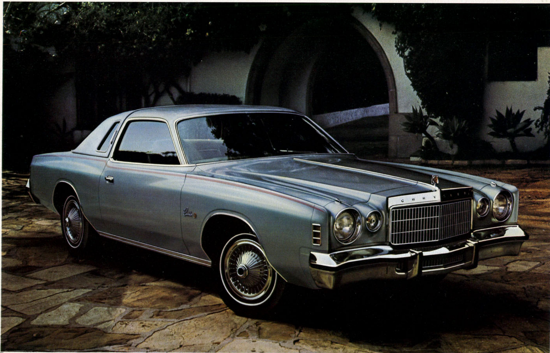
The complete individual. Cordoba with Landau roof.