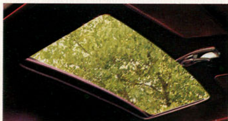
The manually-operated sun roof