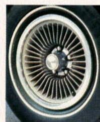
Urethane road wheel