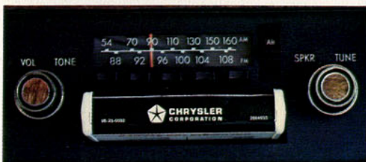
The AM/FM stereo radio with 8-track tape deck