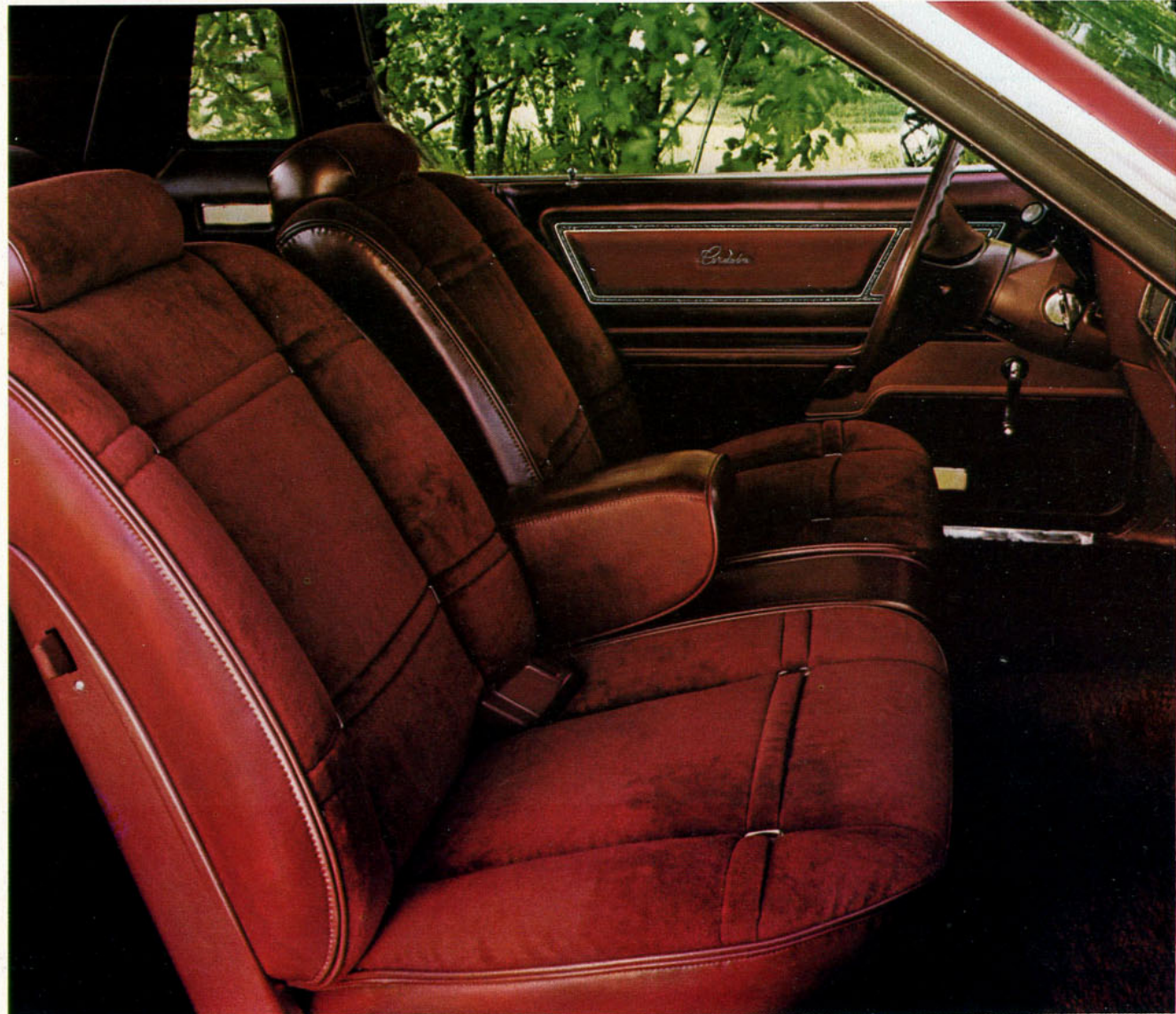
Cordoba standard interior with velour cloth.

Your first clue to Cordoba's relaxing life style is its lavish use of carpeting. Twenty-four-ounce deep-pile shag covers the floor, parts of the doors, and the back of the seats. There are other sound barriers. A molded headliner helps shut out road disturbance. So do the pounds of mastic and foam seals applied over the already well-prepared surfaces of Cordoba's all-welded Unibody. Even the standard carpeted trunk and spare tire cover do much to promote quieter road manners, made already quiet by a total system of rubber suspension isolators and other noise reducing components in Cordoba's well-engineered underbody design.