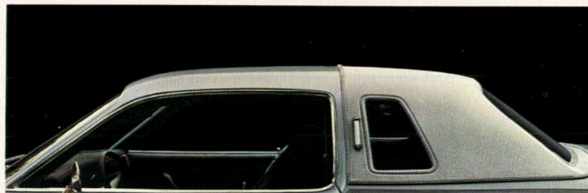
The luxurious Landau roof