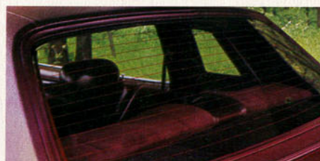
The electric rear window defroster