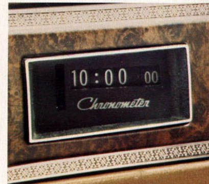
The accurate digital clock is standard.