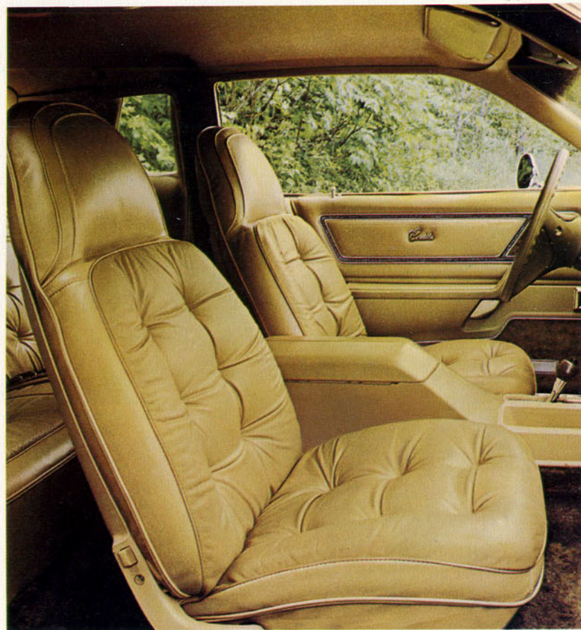
Cordoba's optional bucket seat, superbly tailored leather with vinyl trim.

Driving controls are located for easy use. Light and wiper/washer switches and heater/air