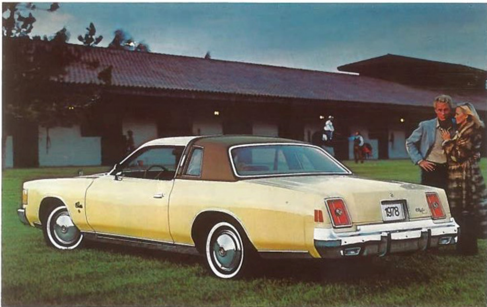
Cordoba with optional Landau vinyl roof

deck lid line and enlarged taillamps to further enhance the outward thrust appearance . . . combined parking, turning, side marker and optional cornering lamps mounted in the fender end caps. There are eight new Cordoba exterior colours available including four "Sunfire" metallics