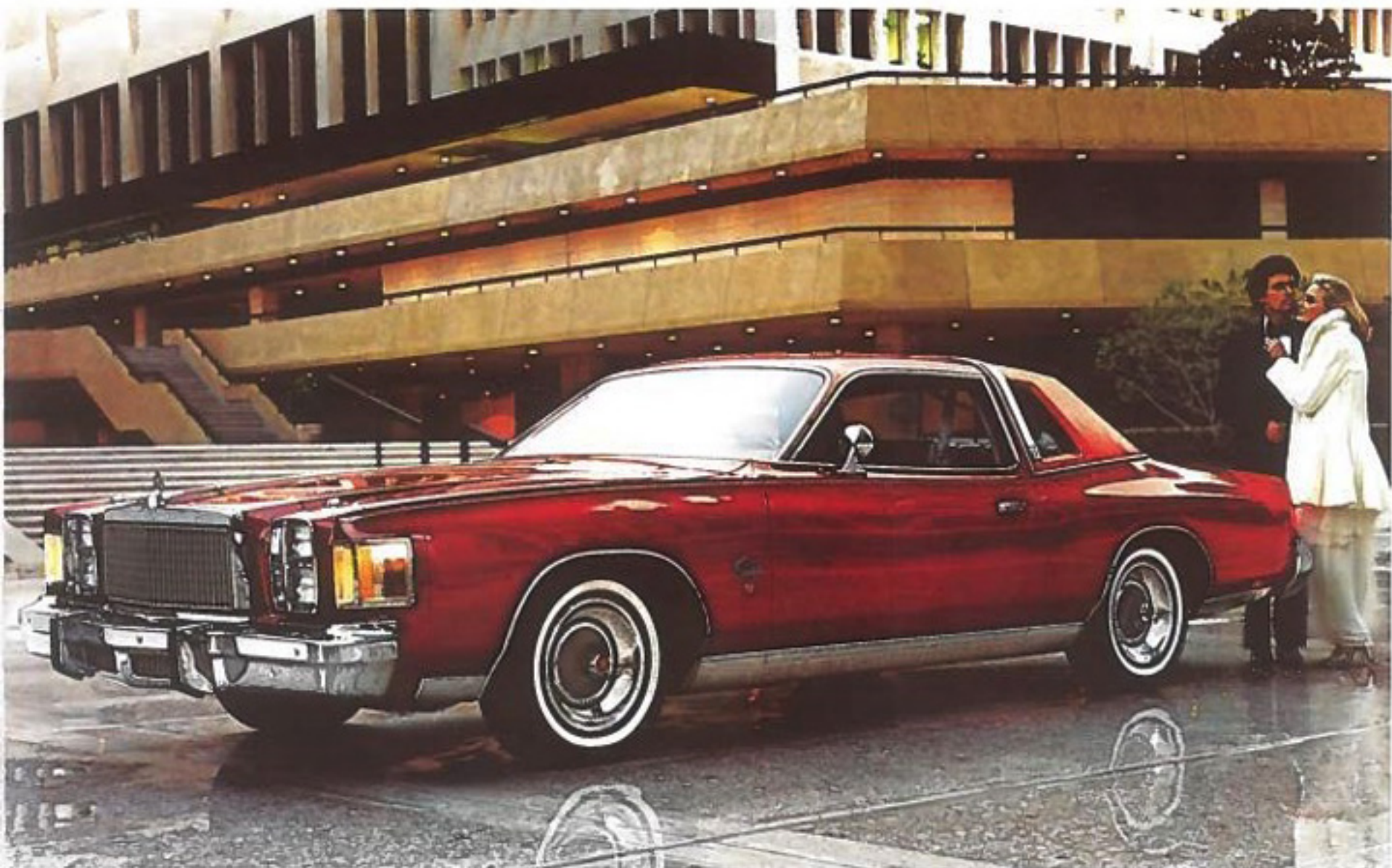
Cordoba with optional "Crown" Landau vinyl roof