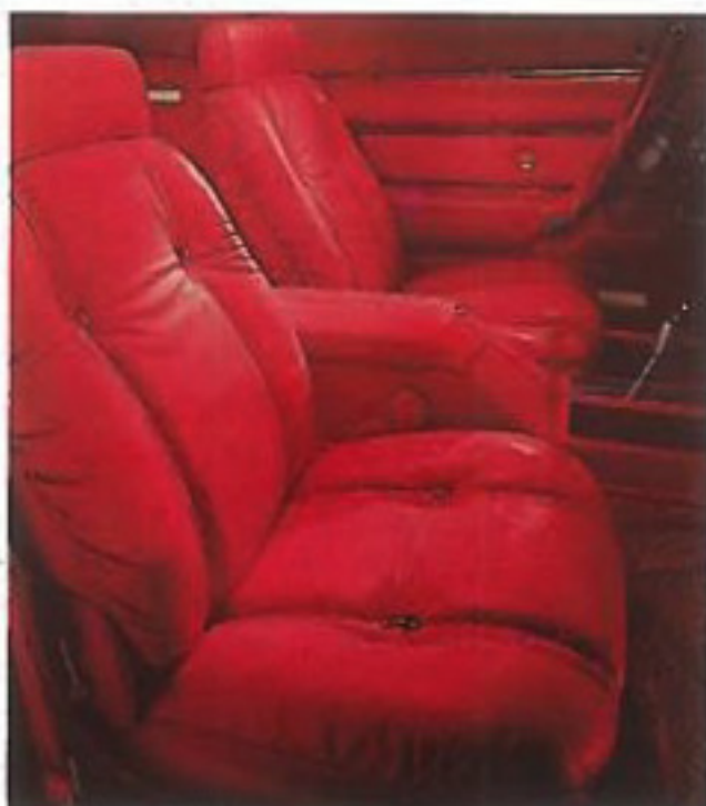
Optional Leather Bucket Seats