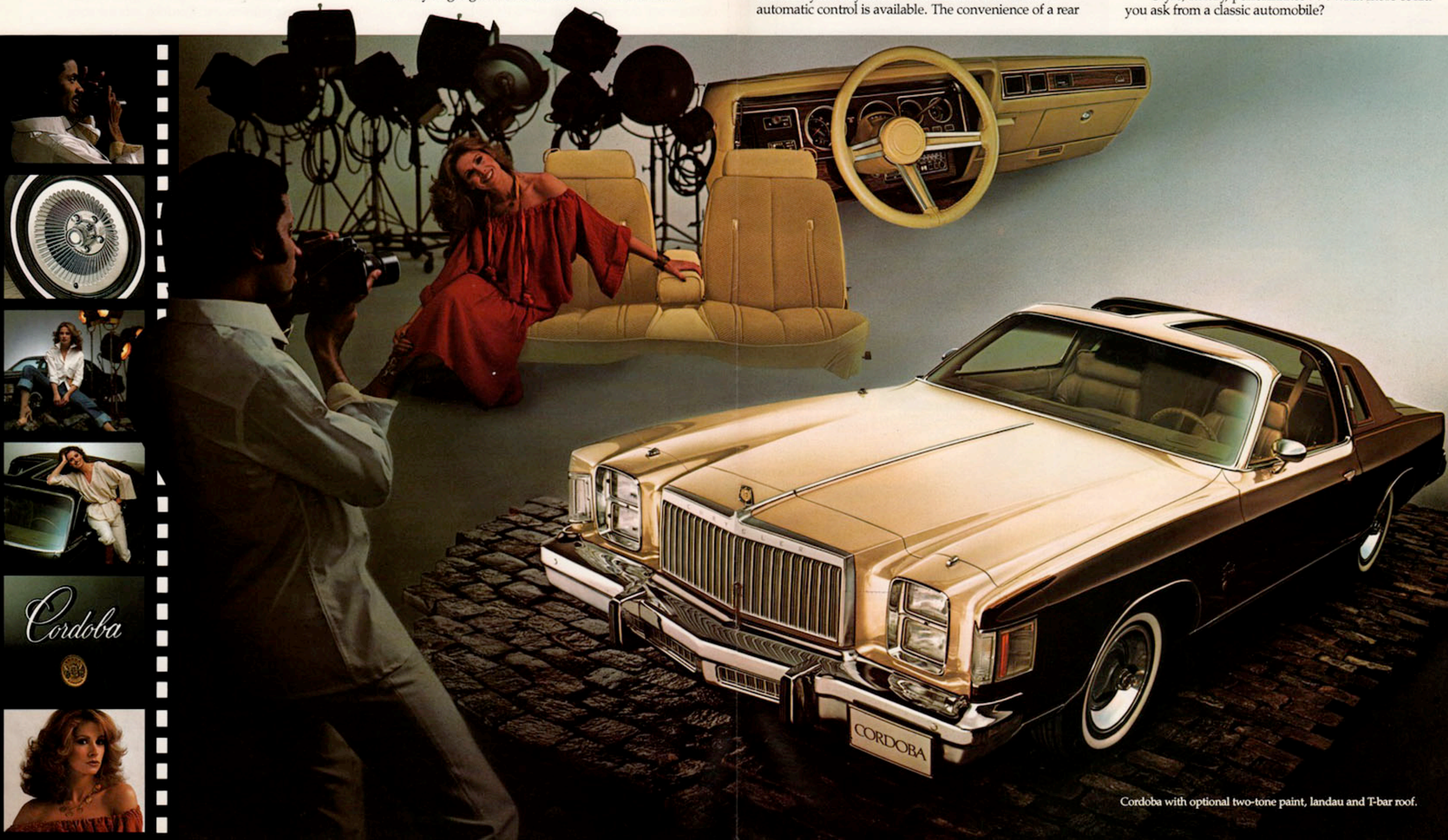
Cordoba with optional two-tone paint, landau and T-bar roof.

Style, luxury, performance . . . what more could you ask from a classic automobile?