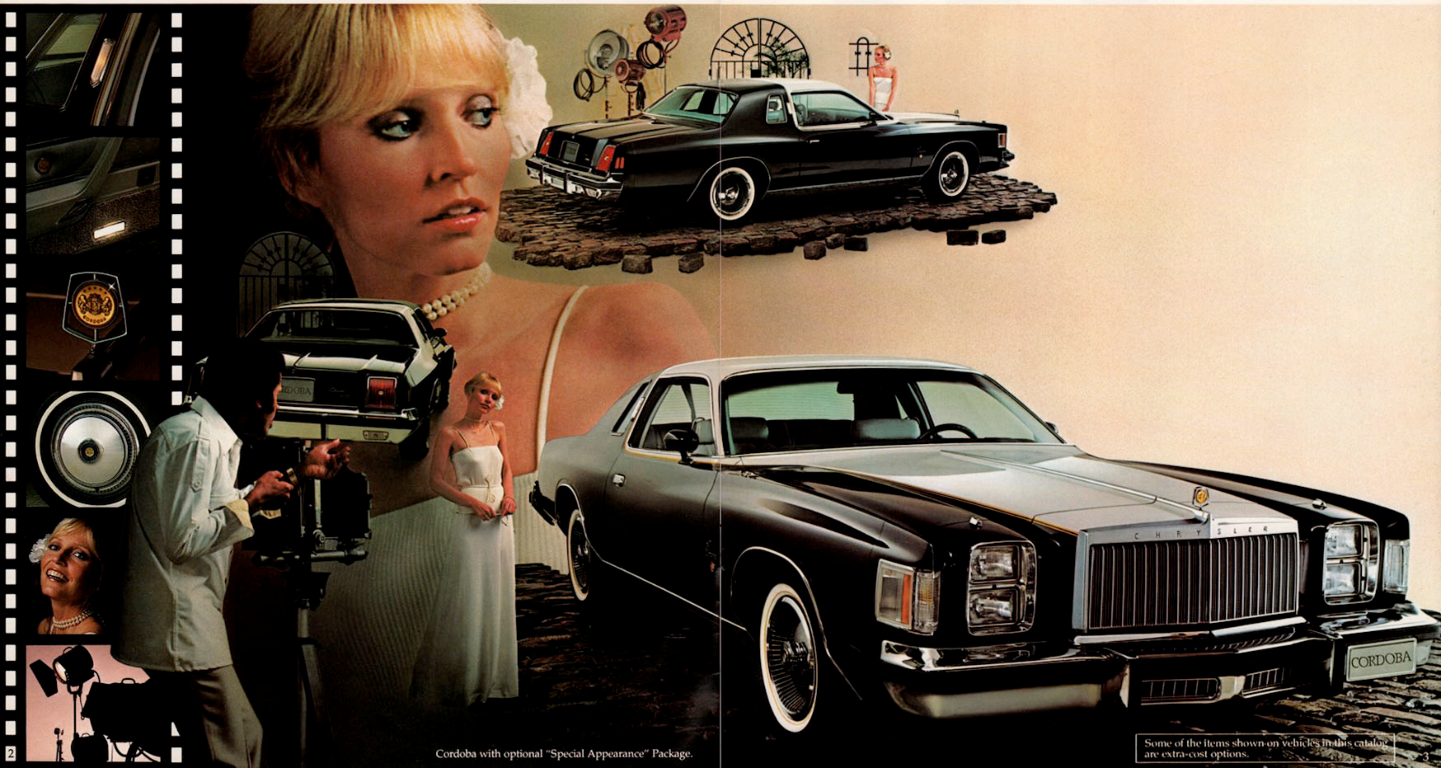
Cordoba with optional "Special Appearance" Package.

In its interior luxuries, exterior styling and engineering refinements, Cordoba sets the style.