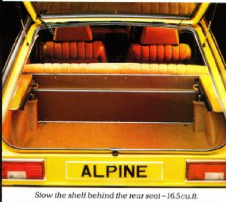
Stow the shelf behind the rear seat - 16.5 cu.ft.