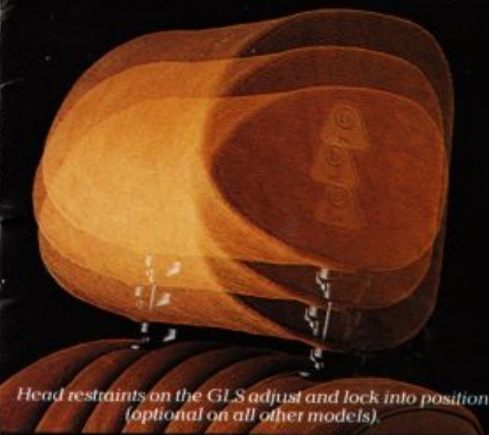
Head restraints on the GLS adjust and lock into position (optional on all other models).