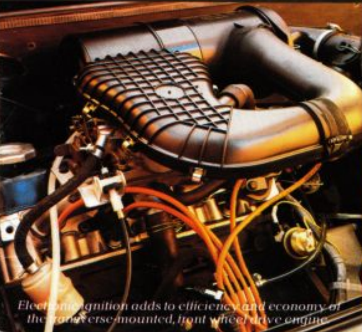
Electronic ignition adds to efficiency and economy of the transverse-mounted, front wheel drive engine.