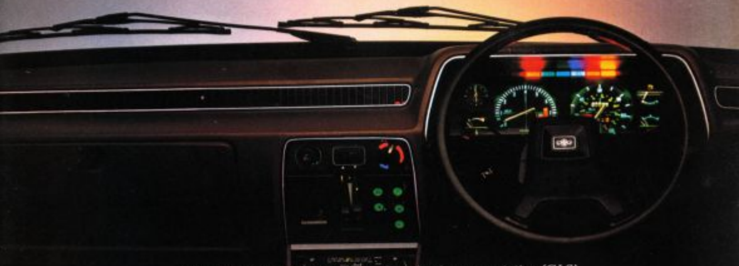
Cockpit view of the clear, comprehensive instrumentation (GLS)