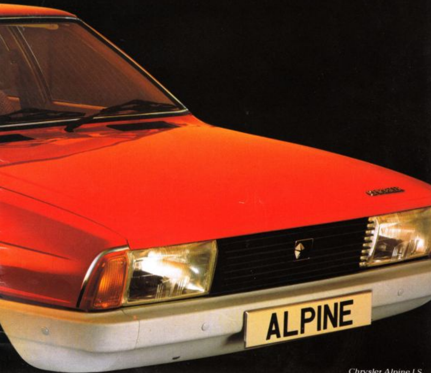
Chrysler Alpine LS

Stylish, powerful, spacious, safe: that's today's Chrysler Alpine.