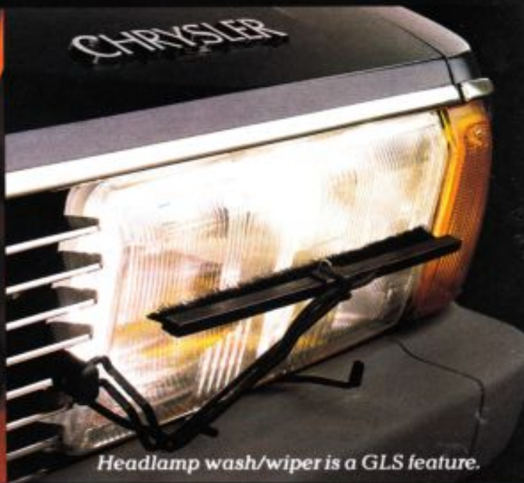
Headlamp wash/wiper is a GLS feature.