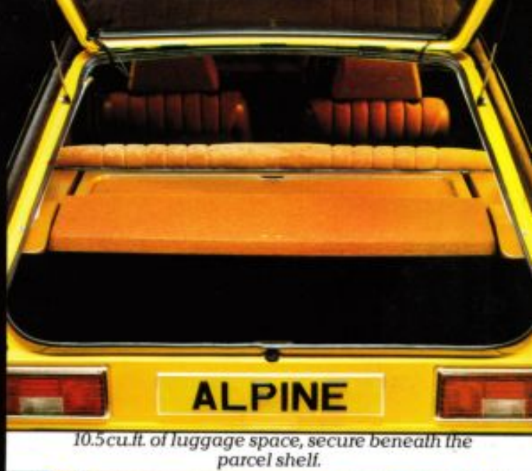
10.5 cu.ft. of luggage space, secure beneath the parcel shelf.