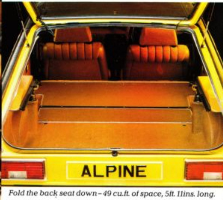
Fold the back seat down - 49 cu.ft. of space, 5ft. 11ins. long.