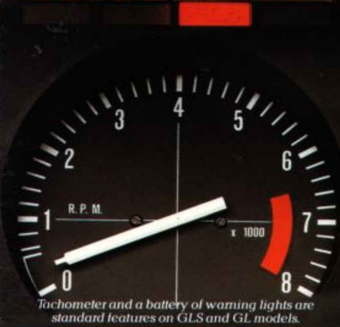
Tachometer and a battery of warning lights are standard features on GLS and GL models.