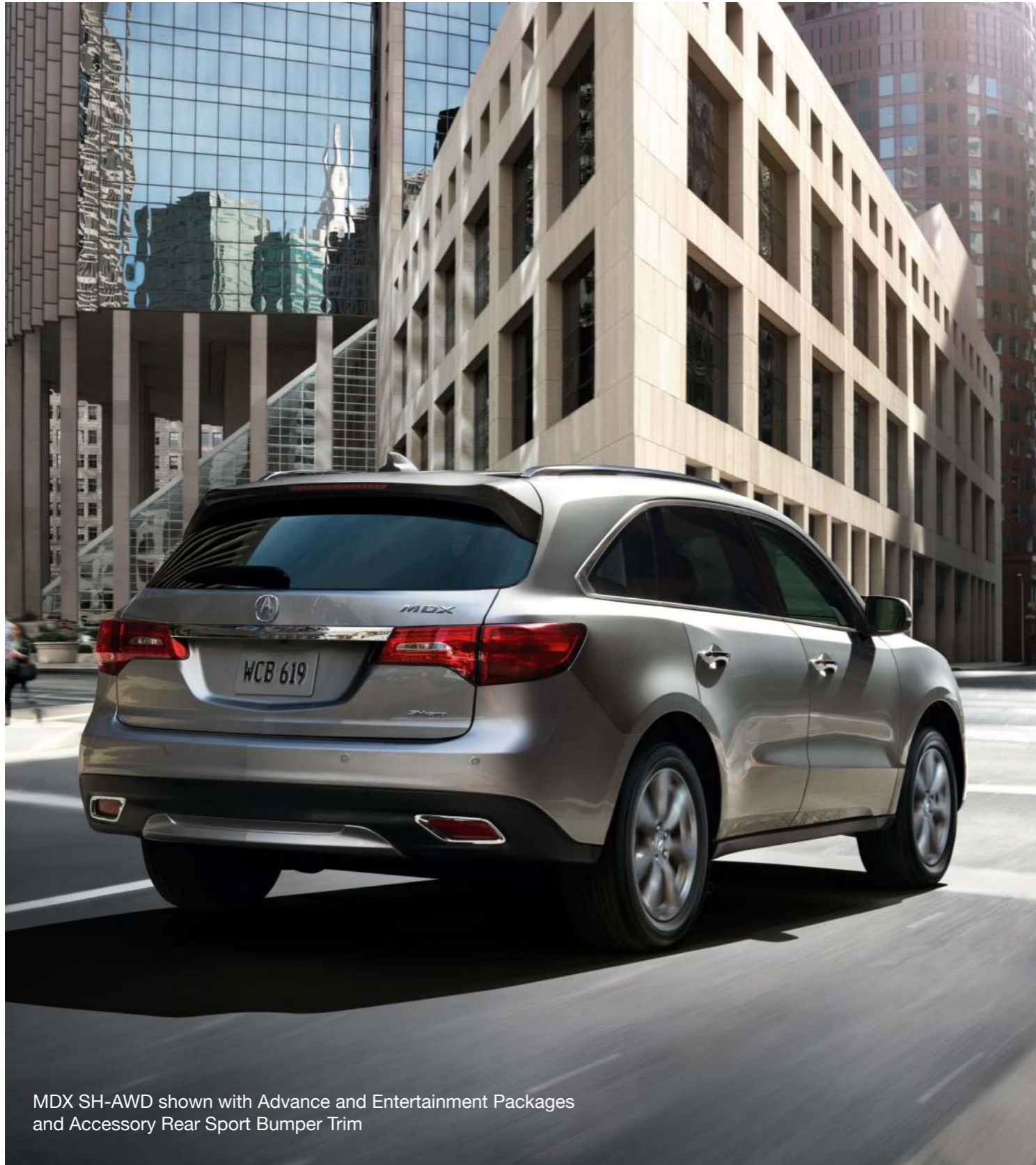
MDX SH-AWD shown with Advance and Entertainment Packages and Accessory Rear Sport Bumper Trim