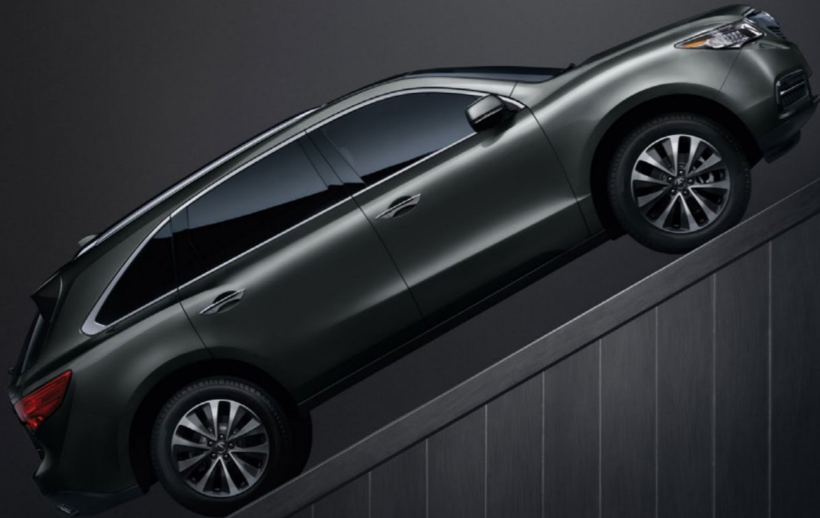
MDX shown with Technology Package and Accessory Roof Rails

It does much, so you can do less. Advanced engineering on the MDX helps make you a better driver. And most of the time, you won't even know it's happening.