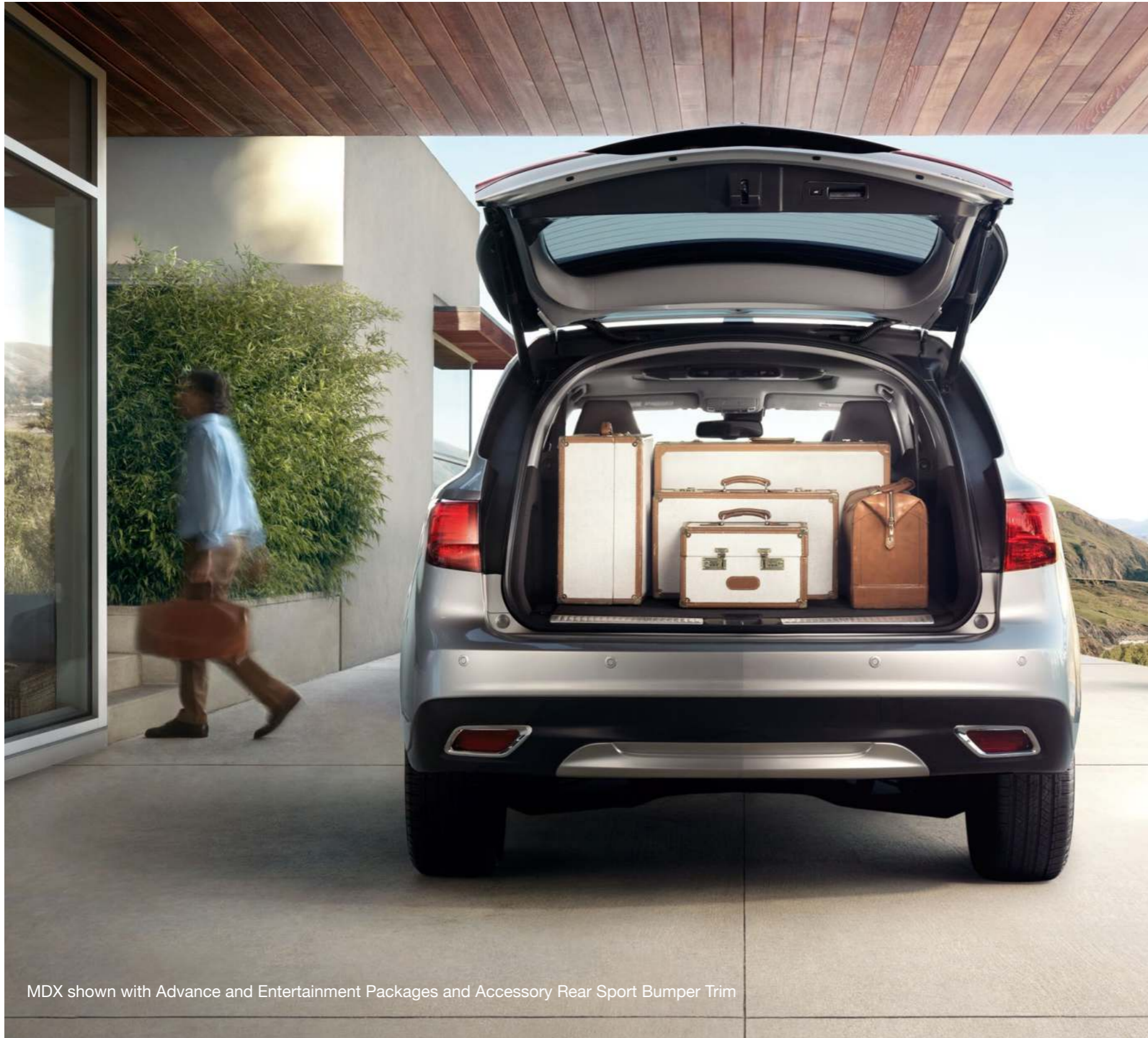
MDX shown with Advance and Entertainment Packages and Accessory Rear Sport Bumper Trim