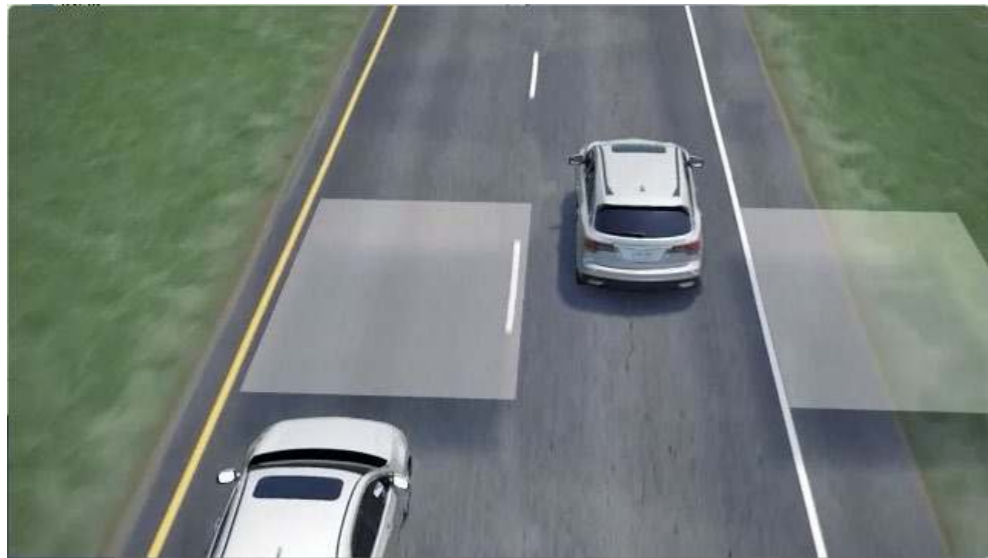
MDX shown with Advance Package