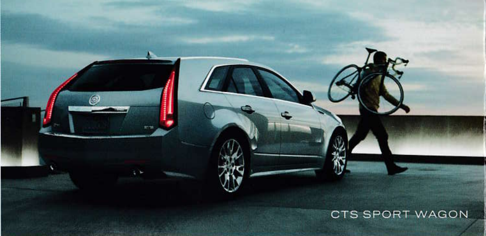
CTS SPORT WAGON

The 2011 Cadillac lineup—including the all-new CTS Coupe, CTS Sport Sedan, CTS Sport Wagon, SRX Crossover and Escalade Platinum and Hybrid—satisfies enthusiasts and luxury-seekers alike. From meticulous engineering to dramatic design to advanced technology, each model is an expression of the performance-driven Cadillac philosophy that blends sophistication with adrenaline.