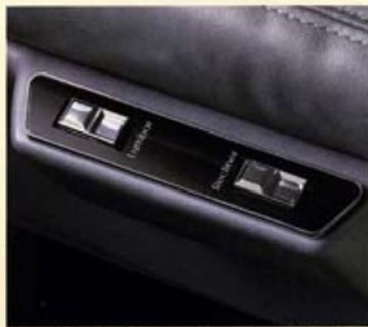
Power Lumbar Support for driver and front passenger on Elegante.