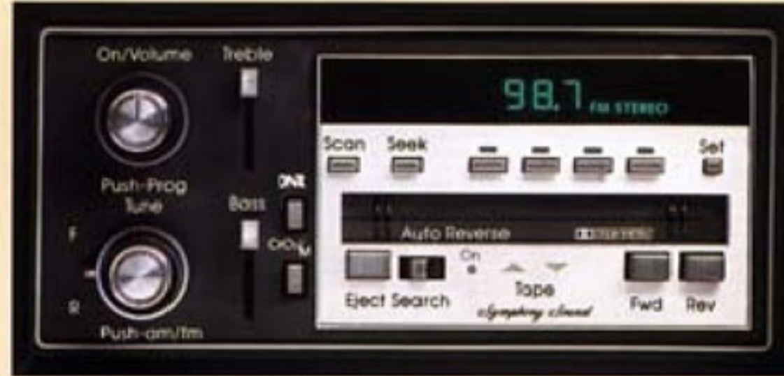
Delco-GM/Bose Symphony Sound System.