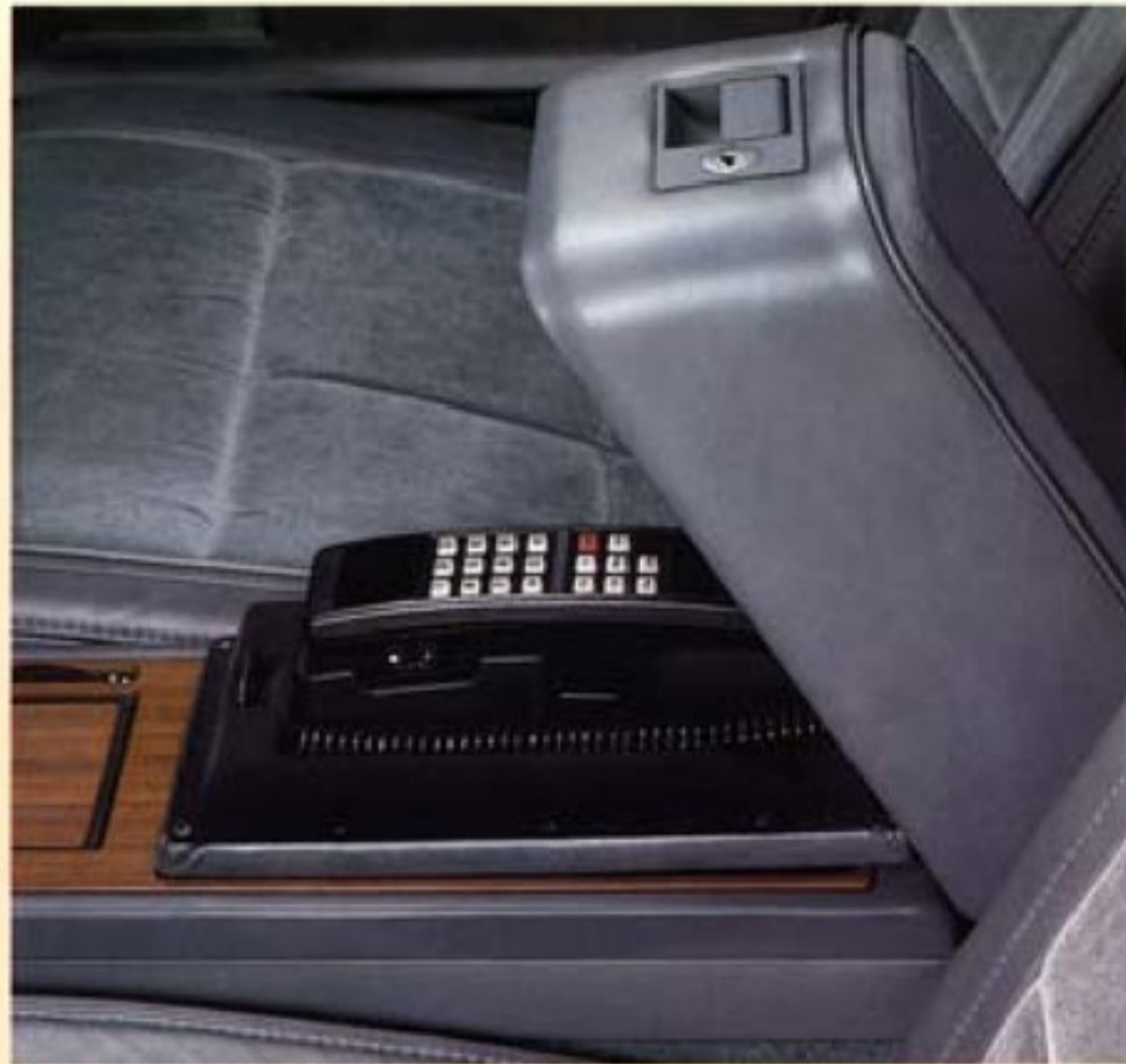
New Cellular Telephone