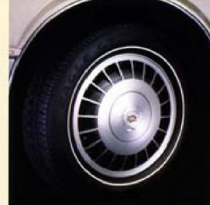
15" Aluminum Alloy Wheel and Goodyear Eagle GT Tire.

Entry System, Remote Fuel Filler Door Lock, Automatic Door Locks and Theft-Deterrent System.