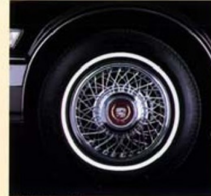
Wire Wheel Disc.

Security Option Package. Includes Illuminated