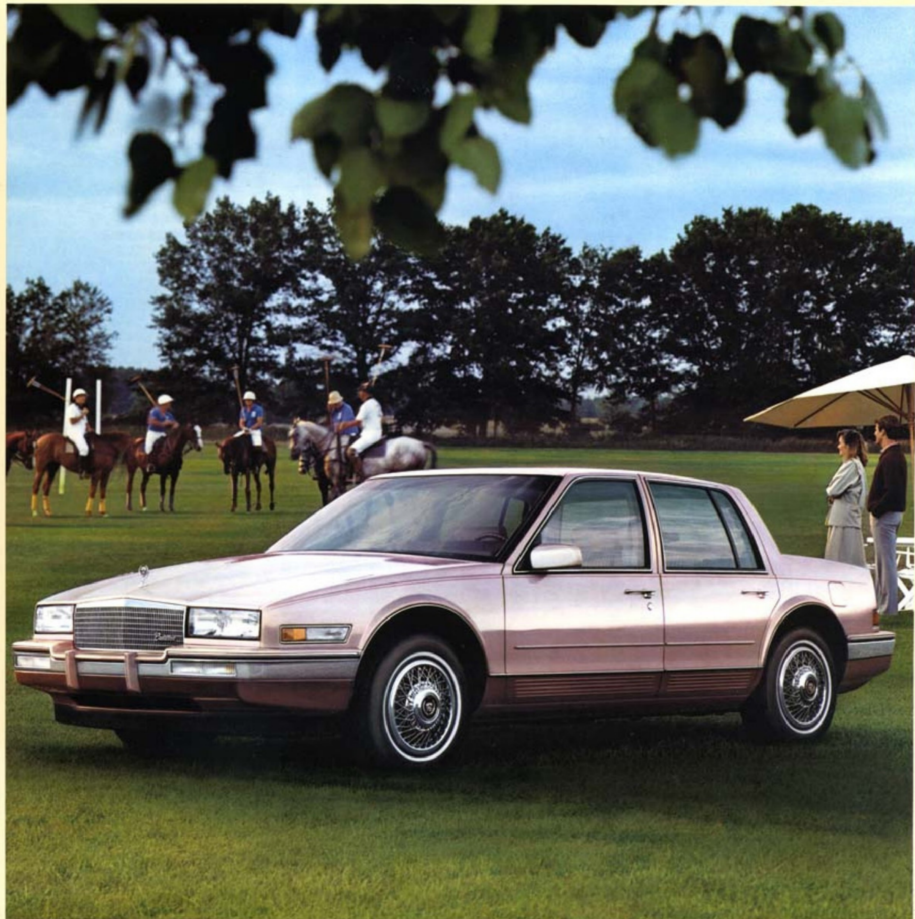
1986 Seville shown in available Quartz Firemist and Quartz.