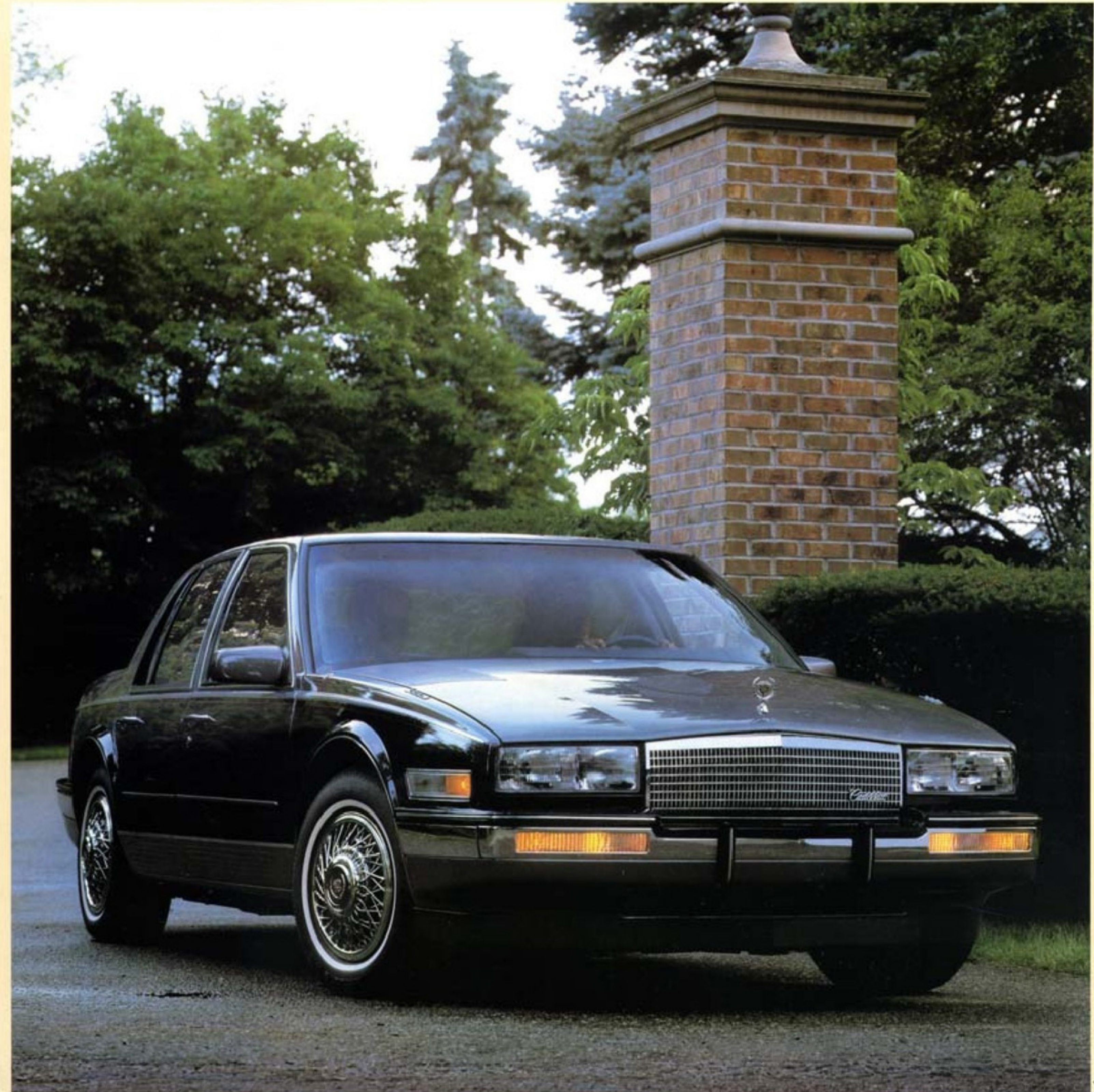
1986 Seville Elegante shown in Academy Gray and Sable Black.

Above all, it's the feeling of uncompromising excellence. A tradition of quality and attention to driver and passenger needs and demands. Is it any wonder driving a new Cadillac is a pleasure to be envied?