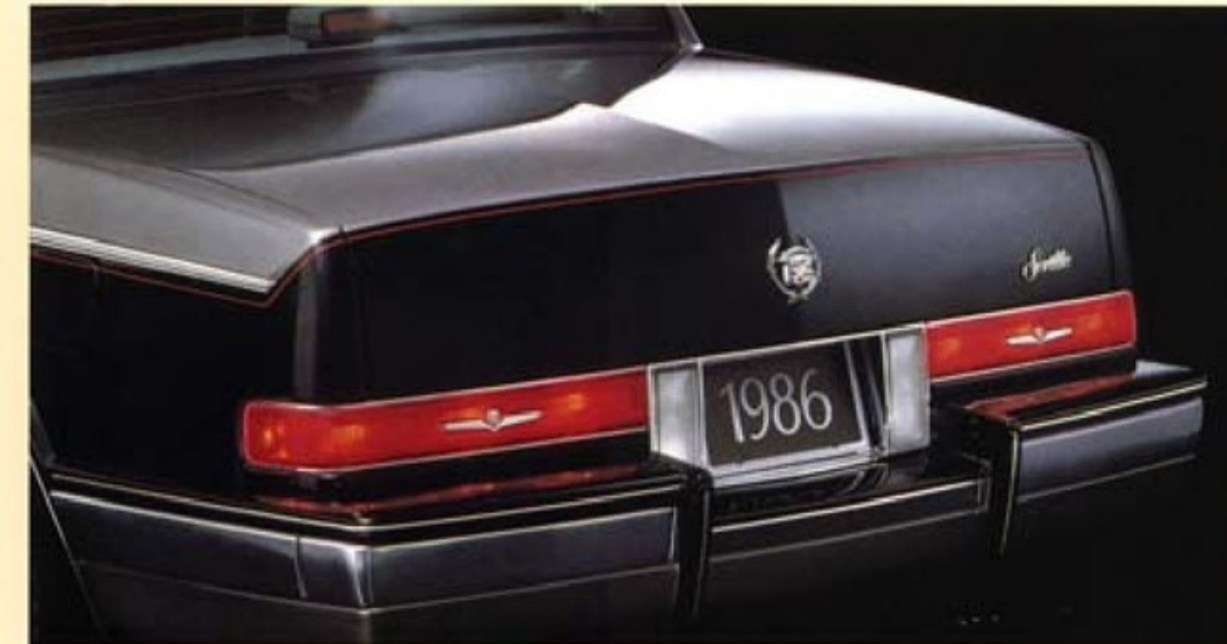
New Wraparound Taillamp Design.

New Front-Floor Console. Includes automatic transmission shift selector, fold-down armrest, two storage compartments, optional cassette storage, rotating cup holder, coin holder and more.