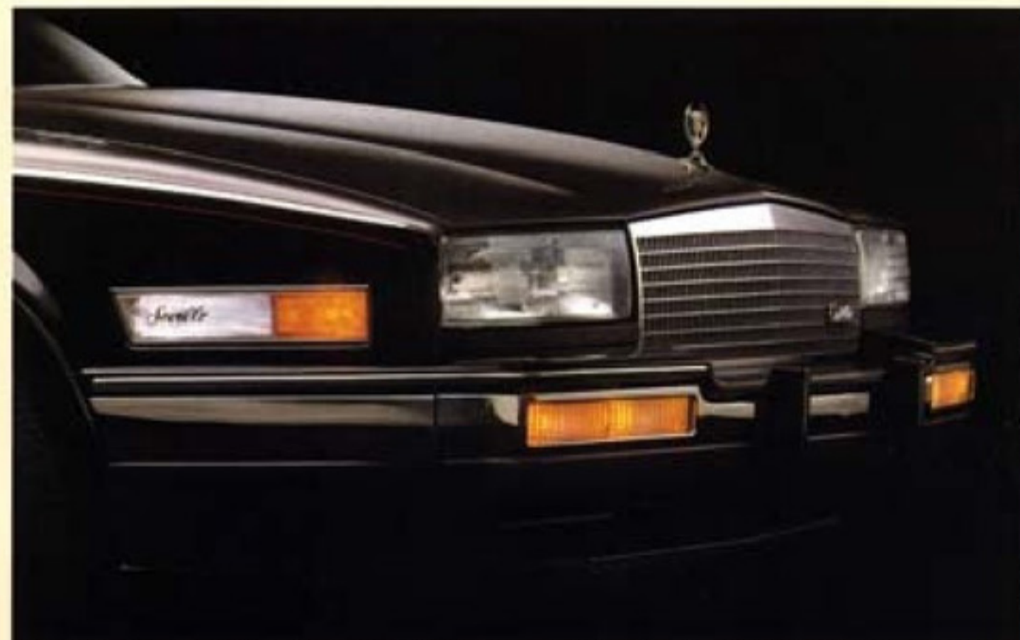
Tungsten Halogen Composite Headlamps and Front Cornering Lights; Front and Rear Lamp Monitors.