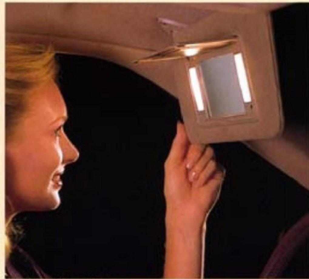
Illuminated Vanity Mirror.