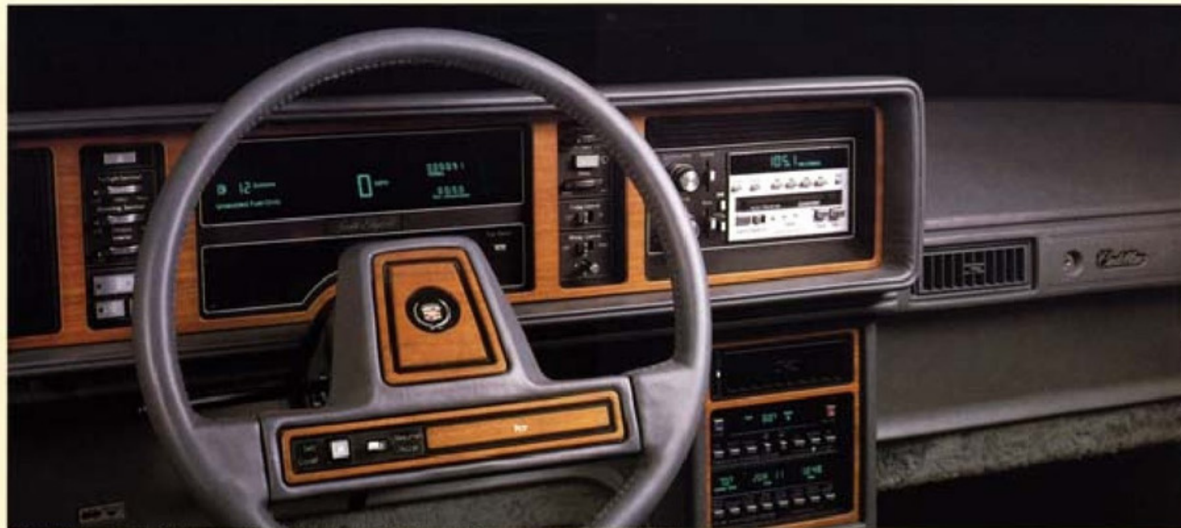
Digital Instrument Cluster and Leather-Trimmed, Tilt-and-Telescope Steering Wheel.