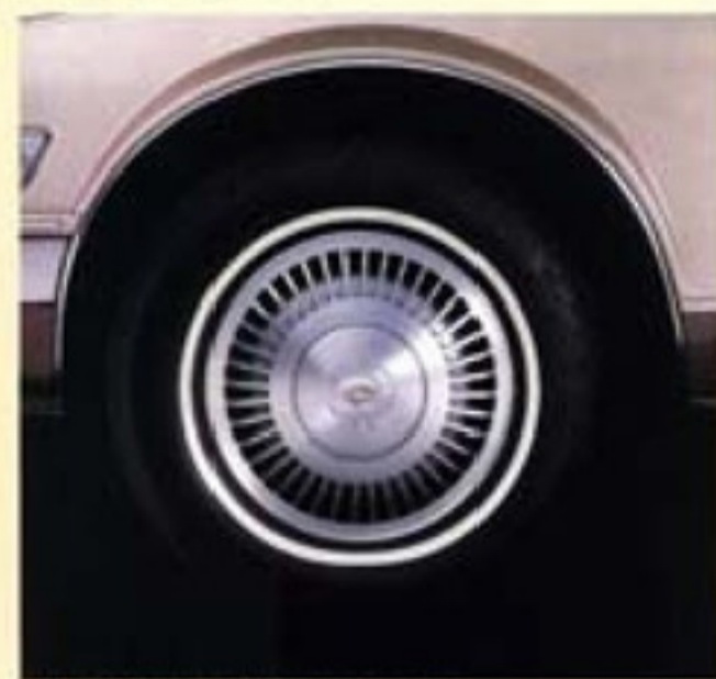
Aluminum Alloy Wheels.