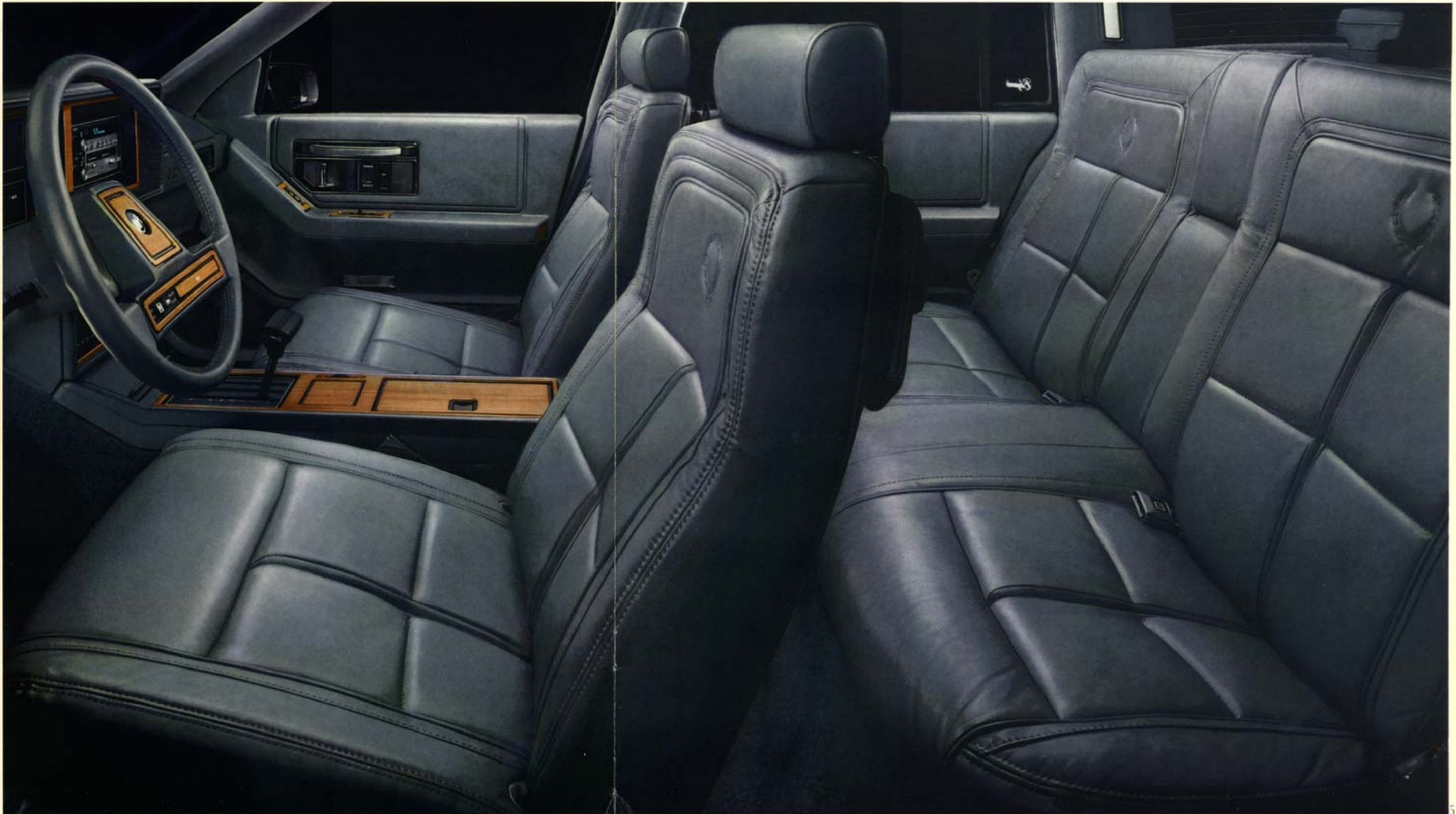
Interior shown with available Gray leather seating areas.

The most visible symbol of the advanced electronics found on Elegante and all Sevilles is the driver information center. Think of it as the monitor of powerful, personal computers that will continually keep you apprised of the status of your Seville.