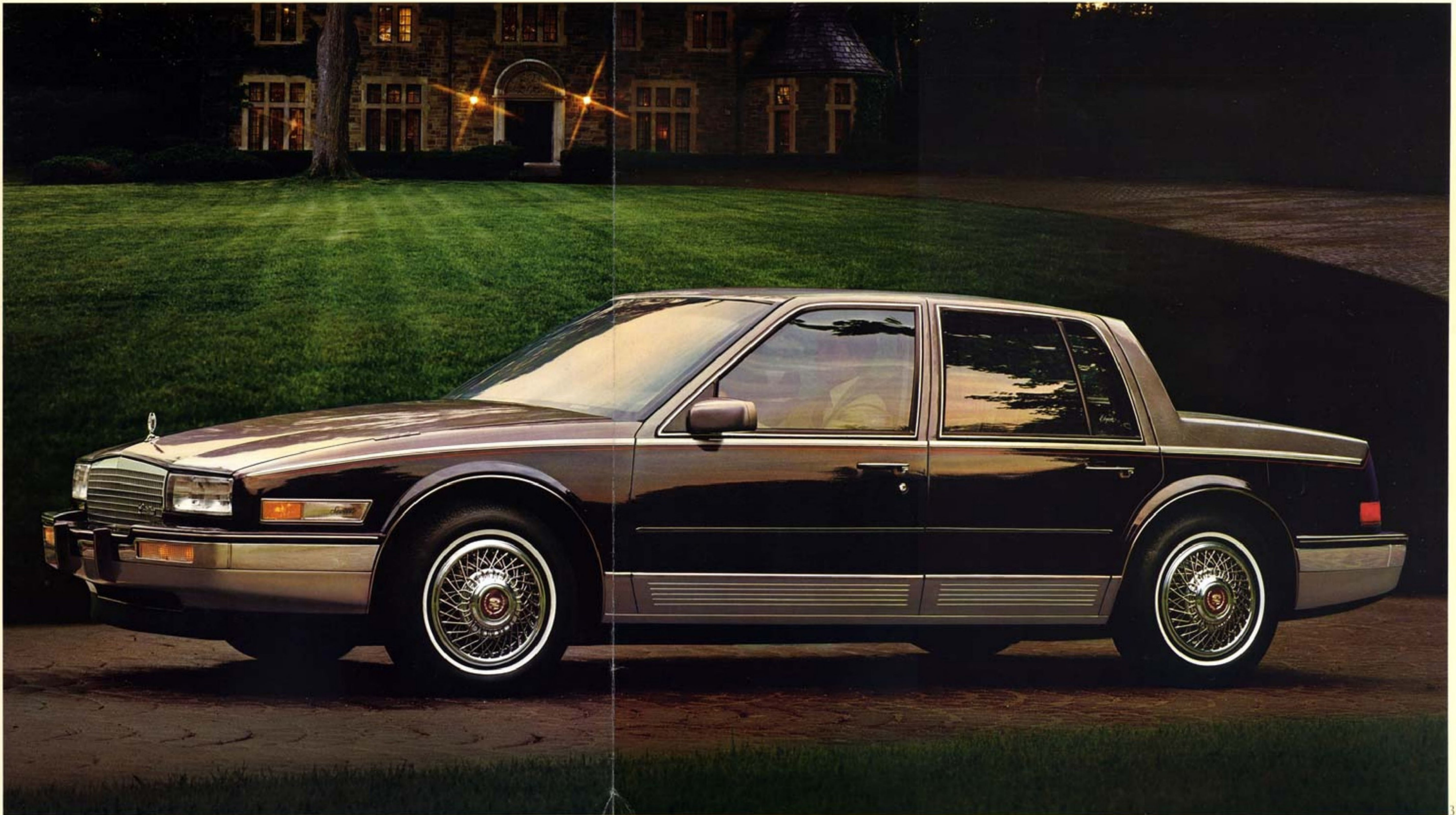
1986 Seville Elegante shown in Academy Gray and Sable Black.

And the optimum Seville is pictured here. Seville Elegante. For 1986, the Elegante distinguishes itself with an exclusive new mid-tone paint treatment that's complemented by upper body accent molding and wire wheel discs.