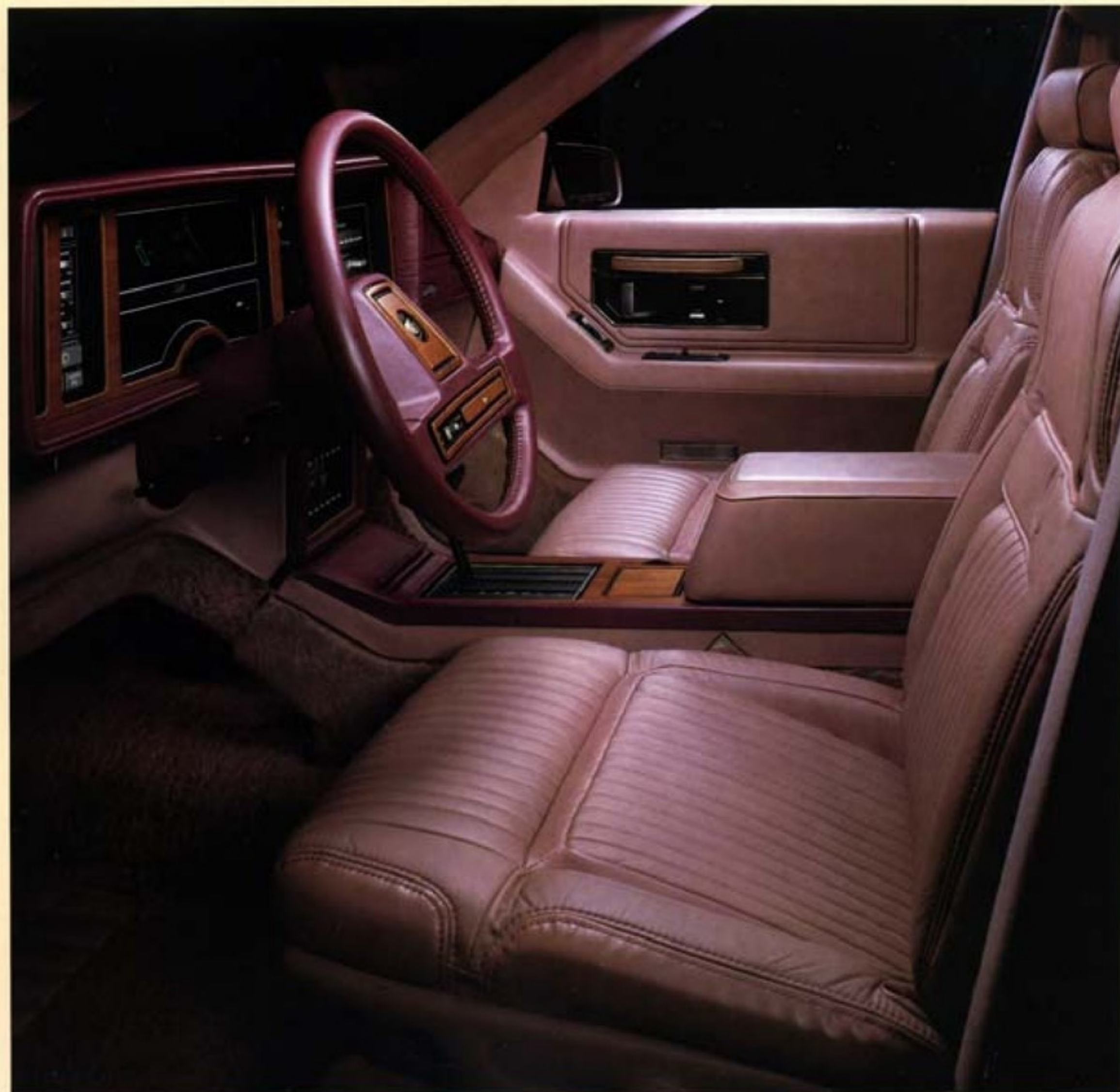
Interior shown with available Quartz leather seating areas.

Genuine American walnut adds a finishing touch to the instrument panel, steering wheel and console.