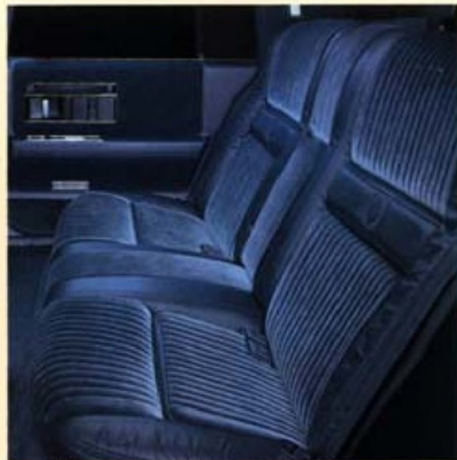
Royal Prima cloth and leather combination seating areas offered in four different colors.