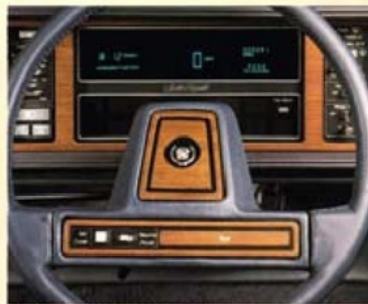
Genuine American Walnut Trim.