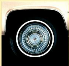
Fleetwood Brougham d'Elegance Wheel Disc.