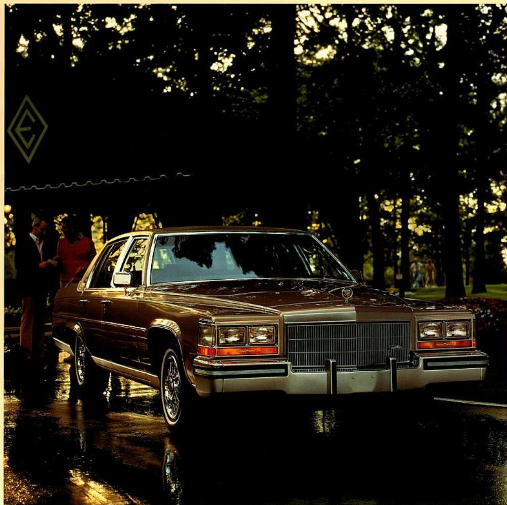
1986 Fleetwood Brougham Sedan d'Elegance shown in available Desert Frost Firemist.

Is it any wonder driving a new Cadillac is a pleasure to be envied?