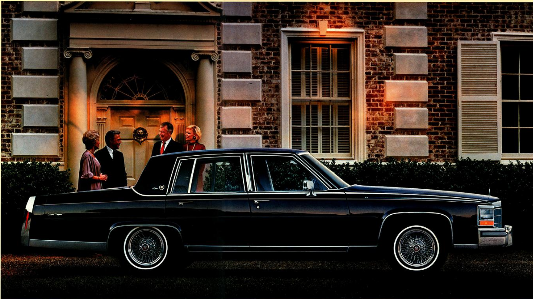
1986 Fleetwood Brougham Sedan d'Elegance shown in Sable Black.

Fleetwood Brougham Sedan d'Elegance for 1986. A car that Cadillac traditions are made of.