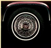
Wire Wheel Disc.