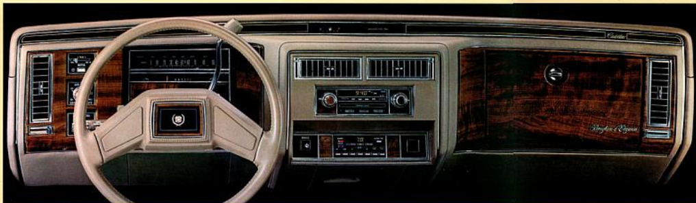
Fleetwood Brougham Instrument Panel.