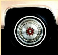
Fleetwood Brougham Standard Wheel Disc.