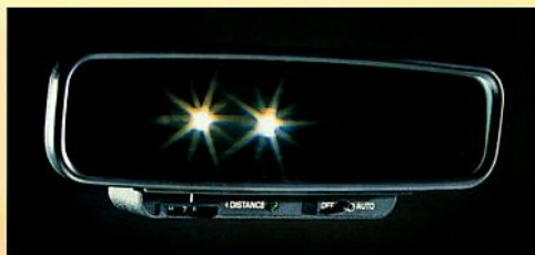
Automatic Day/Night Mirror.