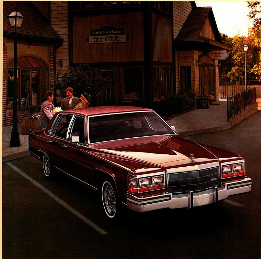
1986 Fleetwood Brougham Sedan shown in available Autumn Maple Firemist.