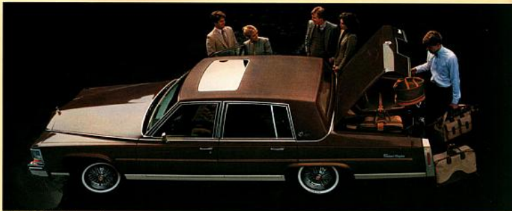
19.6 cubic feet of trunk capacity.