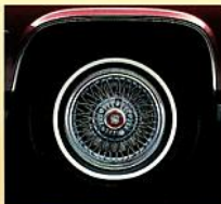
Genuine Wire Wheel.