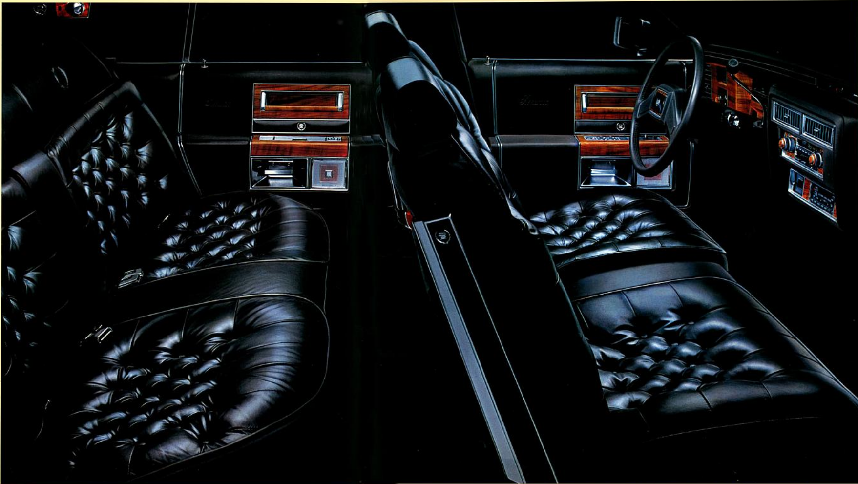
Interior of Fleetwood Brougham Sedan d'Elegance shown with available Black leather seating areas.

Step into the elegant interior world of Sedan d'Elegance with its special tufted pillow-style seating areas and adjustable rear seat reading lamps. The six-passenger roominess is immediately evident—and dual comfort front seats (three-passenger) with six-way power seat adjusters for both driver and front passenger offer the final complement to incomparable driving comfort.