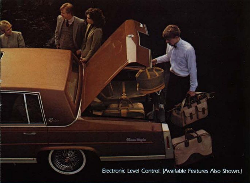
Electronic Level Control. (Available Features Also Shown.)