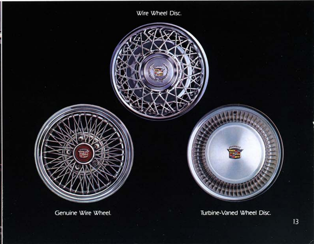
Wire Wheel Disc.