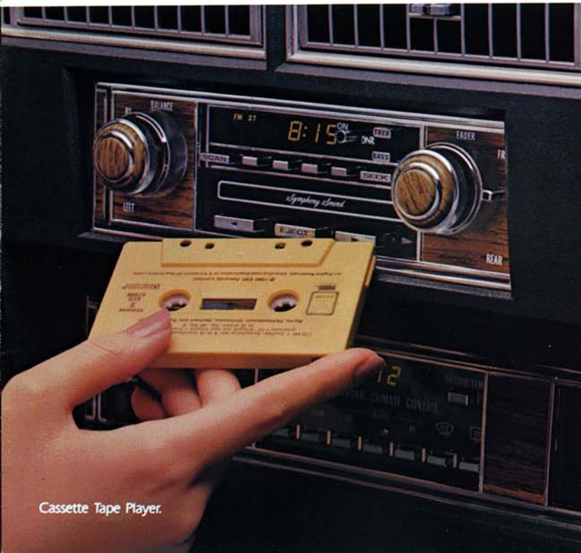
Cassette Tape Player.