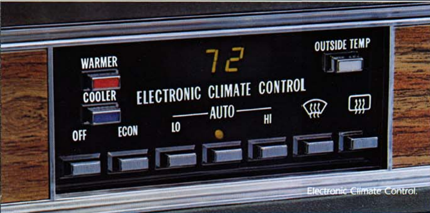
Electronic Climate Control.