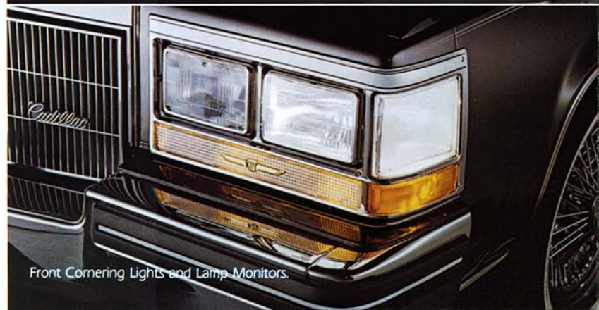
Front Cornering Lights and Lamp Monitors.