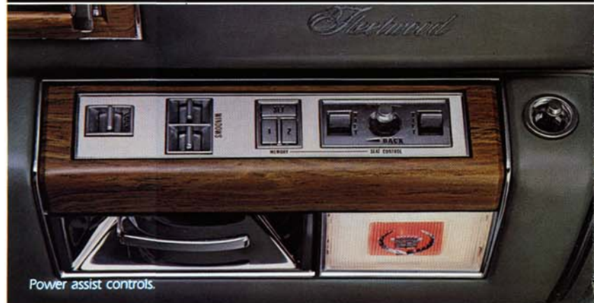
Power assist controls.