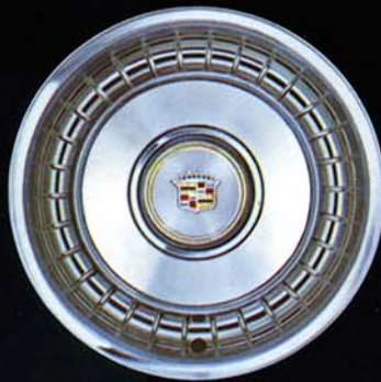
Standard De Ville Wheel Disc.