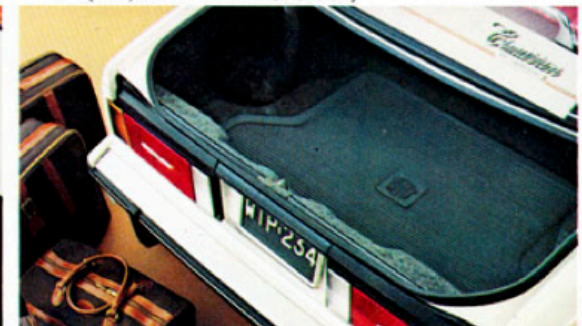
CIMARRON'S SPACIOUS TRUNK