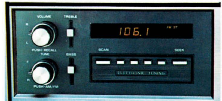
NEW ELECTRONICALLY TUNED AM/FM STEREO RADIO (may be deleted for credit)

Take a good look at Cimarron '83. At the luxurious interior, with its body-contoured, leather-faced front bucket seats with lumbar and lateral support. The leather-wrapped steering wheel. The full instrumentation...including tach. Plus air conditioning and the new Electronically Tuned AM/FM Stereo Radio (may be deleted for credit). All standard. Here is quality and comfort befitting a Cadillac. With room enough for five adults... plus their luggage. The same amount of front seat legroom found in many full-size cars. Plus those special touches...like the hand-buffed exterior finish. Cadillac quality. Cimarron '83.