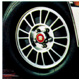
NEW ALUMINUM ALLOY WHEELS