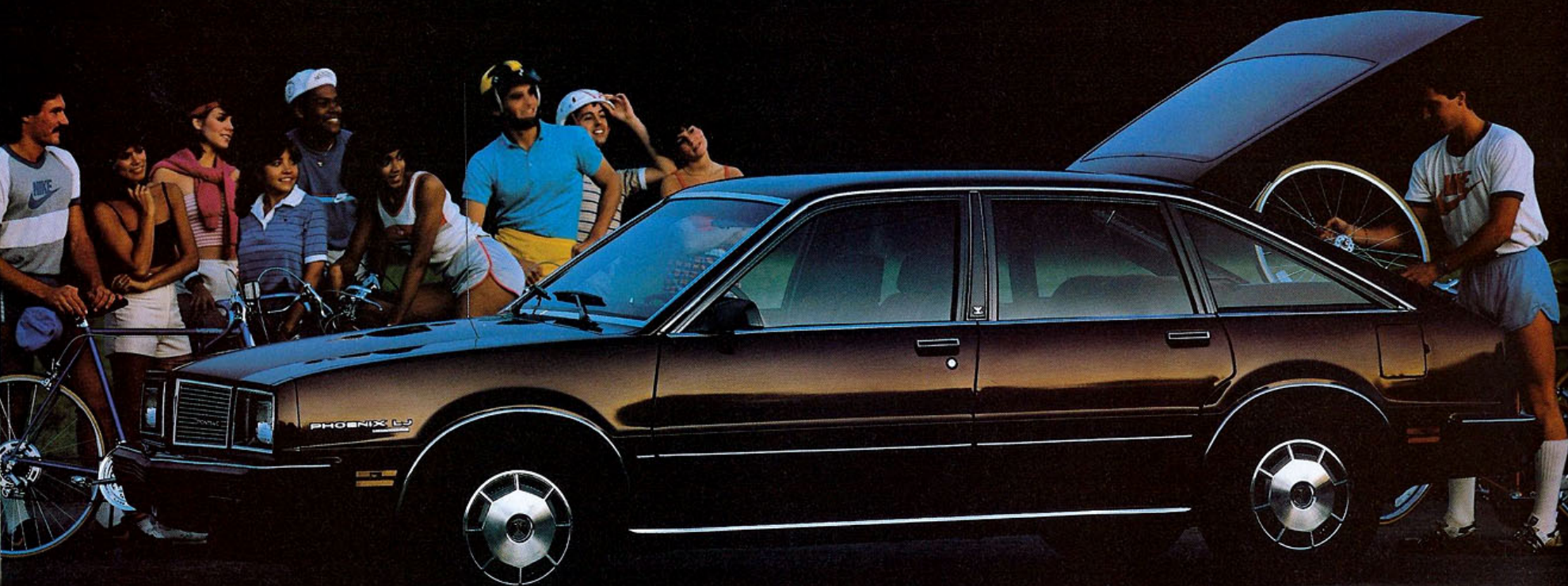
Phoenix LJ 5-door Hatchback.

PHOENIX LJ. For compact versatility, look into Phoenix LJ Hatchback. With the rear seat folded down, you'll find 41 cubic feet of cargo space. And thanks to the removable cargo cover, valuables stay hidden from curious eyes.