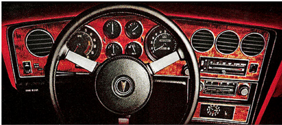
Grand Prix instrument panel. Shown with available rally gauge cluster and Custom Sport wheel.