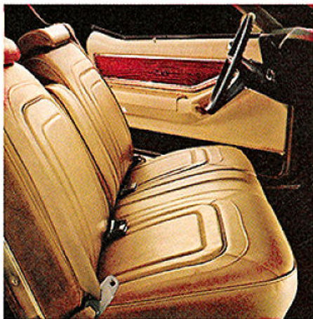
Available bench seat in all-Morrokide. Shown in saddle—also available in blue and white.

Deep-contour front bucket seats or notch-back bench seat with cloth and vinyl or all-vinyl trim. All-foam construction front and rear seats. Nylon-blend, cut-pile carpeting with carpeted lower door panels. Console with floor shift (bucket seats only). Custom Cushion steering wheel. High-Low ventilation. Electric clock. Genuine African cross-fire mahogany inlays on door panels and console door. Acoustical insulation. Easy-to-service instrument panel with plug-in components. Ash tray, glove box and instrument panel courtesy lamps. Inside hood latch release. Custom pedal trim plates. Trunk compartment lamp and side panels. Instru-