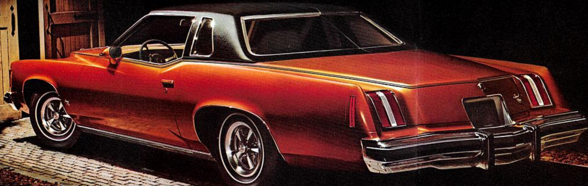
Grand Prix SJ Hardtop Coupe in Fire Coral Bronze.

All-Morrokide upholstery with cut-pile carpeting. Shown in saddle—also available in green, black, burgundy, blue, white and beige.