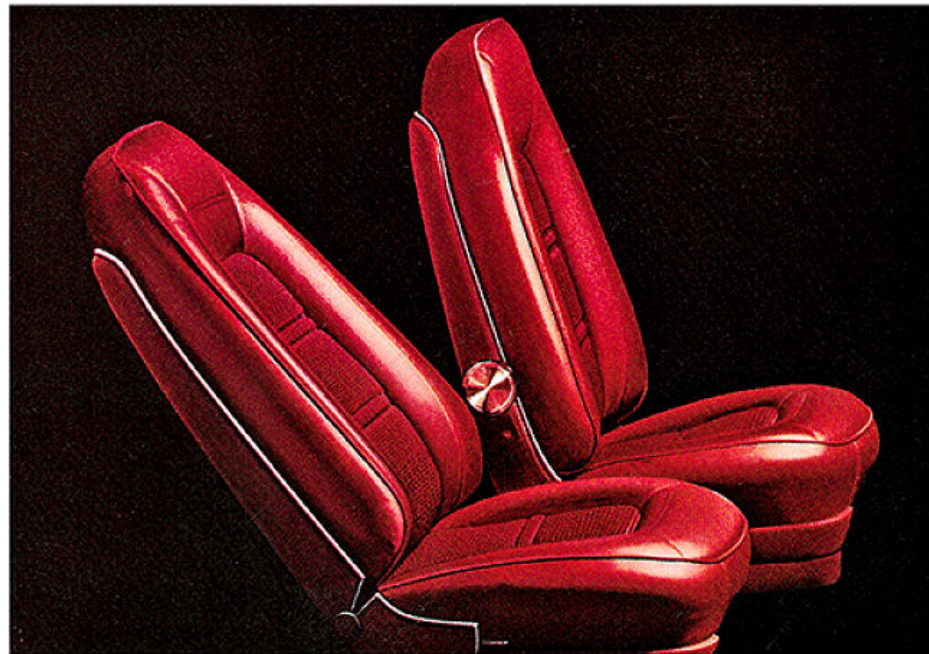
Available reclining bucket seats with adjustable lower back supports.

Improved front and rear bumper systems. Protective rubber strips on bumpers. Rear bumper guards. New side marker lamps. Wide rocker panel moldings. Formal roof line with monogrammed rear quarter windows. Long doors for easy rear seat entry. Deluxe wheel covers. Windshield radio antenna. Concealed wipers. Body-colored door handle inserts. Bright moldings on windshield, quarter window, rear window, windowsill, hood and wheel openings. Bright